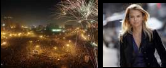
Attacked During Tahrir Square Victory Celebration