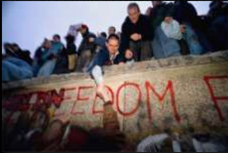
1989: The Berlin Wall Comes Down