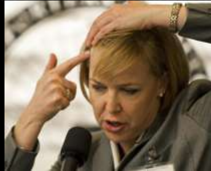
Seven minutes with Kim Dozier: http://youtu.be/STBbQGmoZ7I