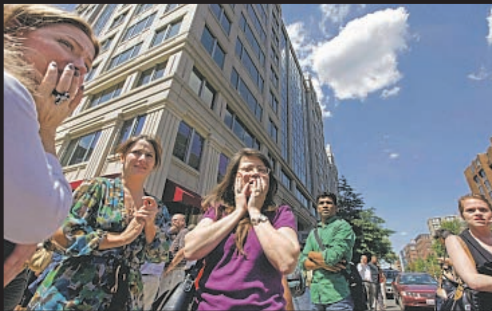
» Office workers gather on the sidewalk in downtown Washington on Tuesday, moments after a 5.8-magnitude tremor shook the nation's capital. The earthquake centered northwest of Richmond, Va., shook much of Washington, D.C., and was felt as far north as Maine and as far south as South Carolina. Story, A4