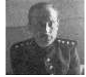
Aleksandras Lileikis was a Nazi officer implicated in 60,000 Jews' deaths. He later worked for the C.I.A.

WASHINGTON — In the decades after World War II, the C.I.A. and other United States agencies employed at least a thousand Nazis as Cold War spies and informants and, as recently as the 1990s, concealed the government's ties to some still living in America, newly disclosed records and interviews show.