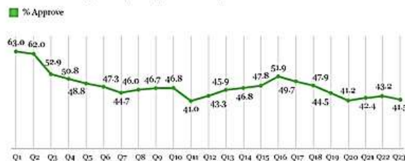
Barack Obama's Quarterly Job Approval Averages

Five post-World War II presidents have been elected to office twice and served a full 23 rd quarter in office. Among these, George W. Bush has the lowest 23 rd quarter average approval rating at 39.1%, just slightly lower than Obama's. In contrast, Dwight Eisenhower, Ronald Reagan and Bill Clinton were much more popular at this stage in their presidencies, with average 23 rd quarter approval ratings of 56% or better. The importance of a president's 23 rd quarter average cannot be