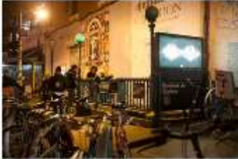
People wait for the elevated Avenue L subway station in Williamsburg that was visited by Craig Spencer, a doctor's without showing symptoms he was tested positive for the Ebola virus in The Bronx. Spencer reported he returned to his city after leaving The Bronx in West Africa.