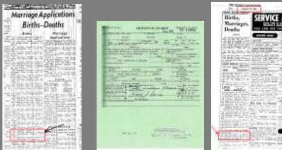
“Birtherism” folds in the face of documentary evidence