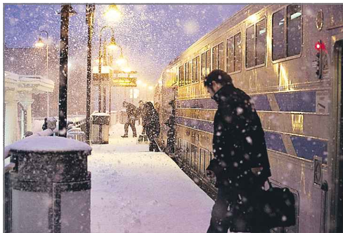
LIRR passengers exit at Port Jefferson as snow picks up Friday.