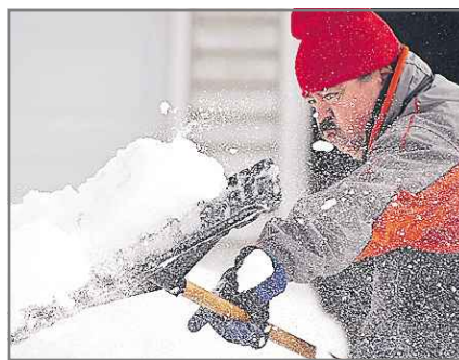
A St. James resident shovels out his driveway yesterday.