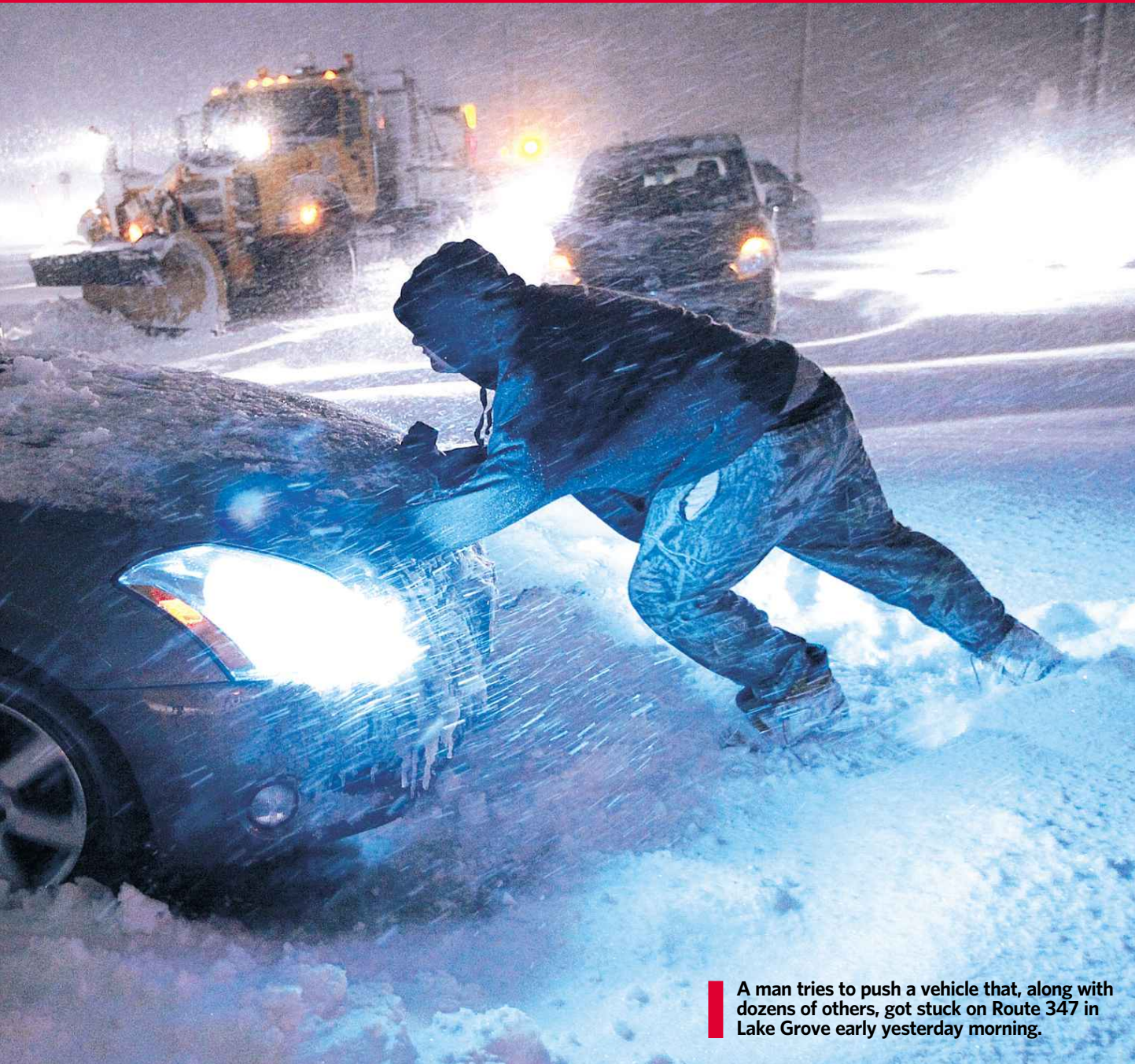
A man tries to push a vehicle that, along with dozens of others, got stuck on Route 347 in Lake Grove early yesterday morning.

Ladd said winds topped out at about 50 mph, lower than the expected 70 mph. As of 9:30 p.m. yesterday, 5,456 customers were still without power.