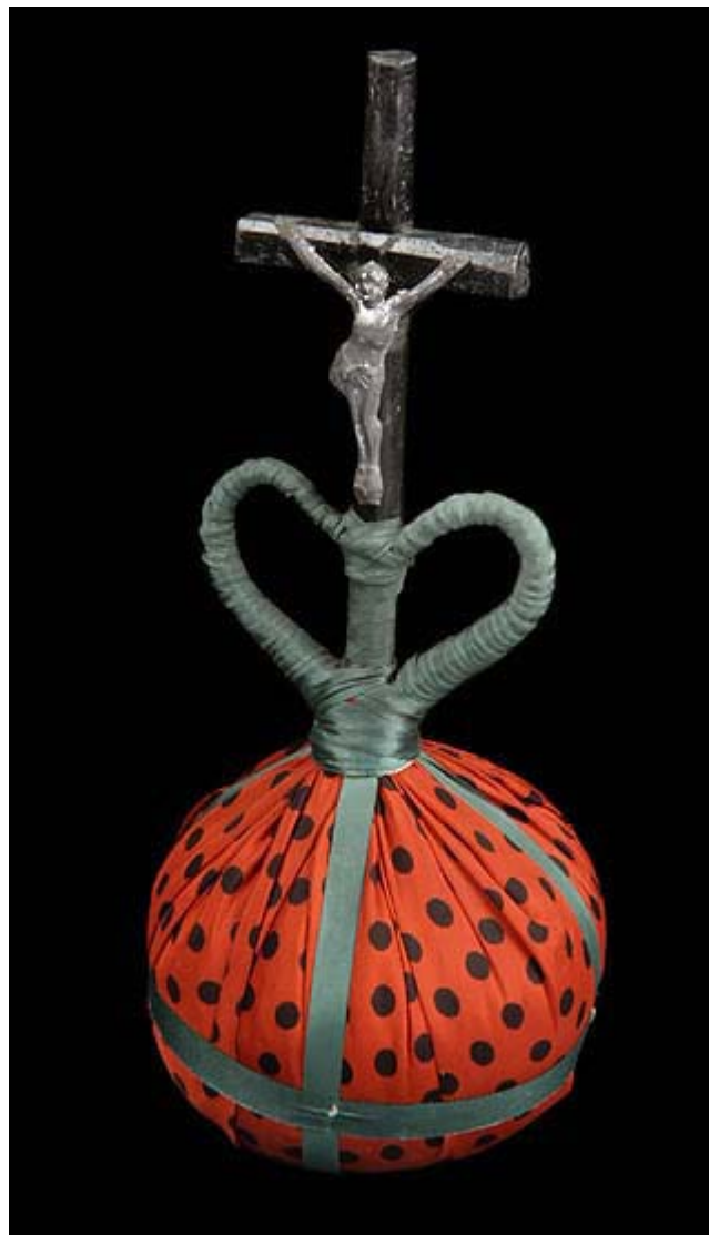
Figure 8: Voodoo orb with Crucifix

(30) But these are ethnographic displays of a new kind. In the first