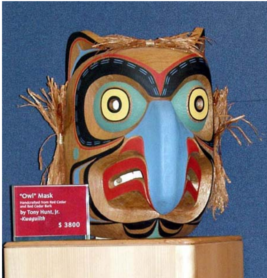
Figure 10: Mask by contemporary Indian artist Tony Hunt, Jr. for sale at the NMAI giftshop

(34) Nouvel invited eight members of an Australian aboriginal artists' cooperative to paint the corridors and window frames of the office building on the rue de l'Université side. From the sidewalk one can see the lintels and the sills of the windows covered systematically with regularly repeated patterned black and white, and sometimes black, red and yellow abstract designs. These paintings are continuations of the same patterns which cover the ceilings and side walls inside (Figs. 11, 12). Moreover, one of the artists, Judy Watson, has painted the outside wall of the same building with what, to my inexperienced eye, looked like ranks of fat grey caterpillars climbing a steep hill. So, there is contemporary art in the Musée du Quai Branly, if for the moment, only from other nations' former empires—and as decor. [25] But also on this rue de l'Université side, close to where the Australians painted, there is a hall for temporary shows of—we are promised—the contemporary art of the global South. The first one, an installation by Yinka Shonibare, a Nigerian-born Londoner, "Jardin d'Amour," is scheduled to open in the spring of 2007. [26] Displaying art made today by artists from the South as either interior design or in temporary exhibitions are inadequate answers to the question—which the planners of Quai Branly seem not seriously to have posed themselves—of the status in the West of the present day art of the South.