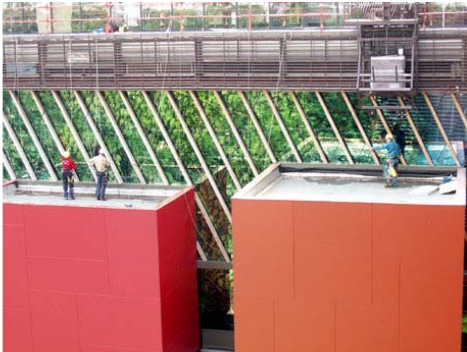
Figure 1: Exhibition boxes with leafy wall behind. (Most images can be clicked for a larger version.)

(4) Twisty paths led towards the big building. The walkway was bordered