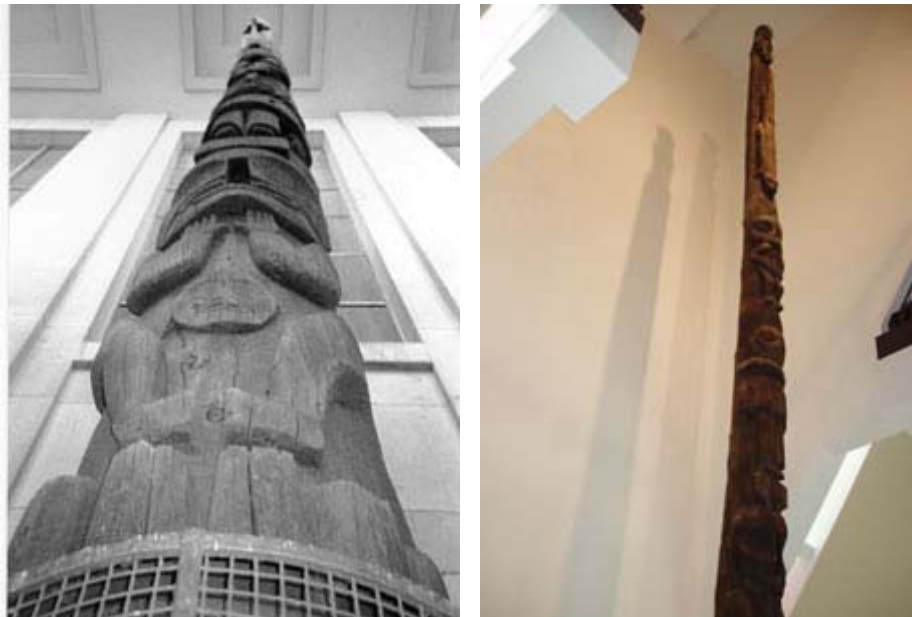
Figures 2, 3: Totem Pole as it was in front of the Musée de l'Homme and now in the lobby of the Musée du Quai Branly

(6) Tunnels usually end in blessed light. On emerging from this one, the visitor is plunged into the yet darker world of the exhibition plateau. Music with a strong drum beat was playing faintly. It could be heard almost subliminally. The drumming and other exotic music, playing in different parts of the exhibition hall, as well as the “primitive” objects vaguely visible from a distance in the obscurity of the hall made me think—as other reviews have also suggested—of Conrad's story of African savagery. [2]