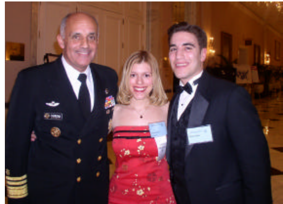
Surgeon General Carmona