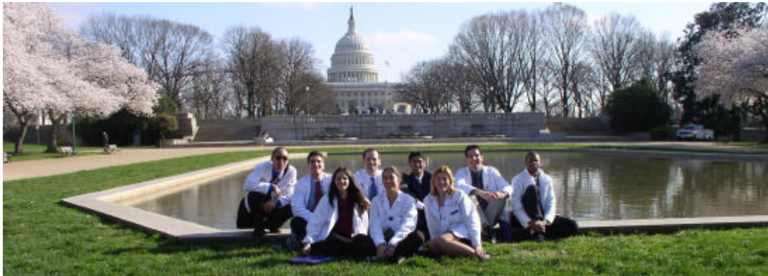
Award recipients taking time out for a picture