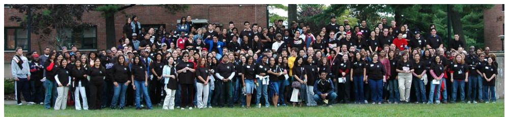
Student Affairs Student Staff event – Fall 2004