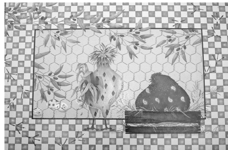
Floor Cloth by Joyce Juengst

Five Mondays, begins 3/6, 6:30 pm - 8:30 pm. Instructor: Joyce Juengst $55/student, $80/non-student; Weaving Studio 081.