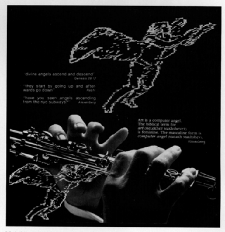
Mel Alexenberg Subway Angel, 1987 Mixed media, 23" x 21"