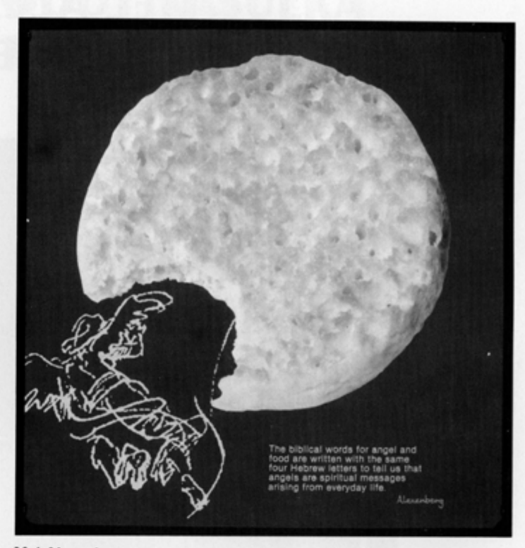
Mel Alexenberg Subway Angel, 1987 Mixed media, 23" x 21"

Front cover: Mel Alexenberg, Rembrandt Observing Computer Transformation of His Drawing, 1987 Relief etching and collage, 30" x 22"