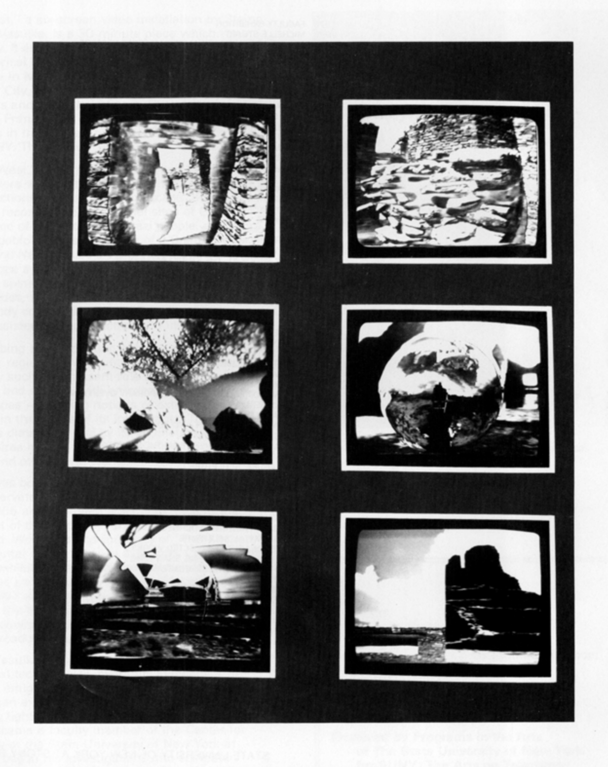
November 24 - December 24, 1987