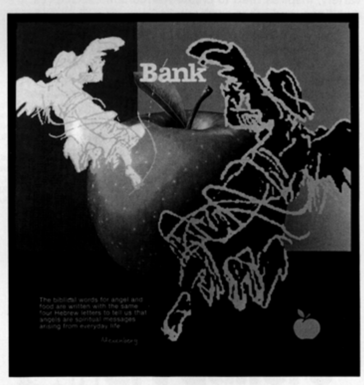
Mel Alexenberg Subway Angel, 1987 Mixed media, 23" x 21"