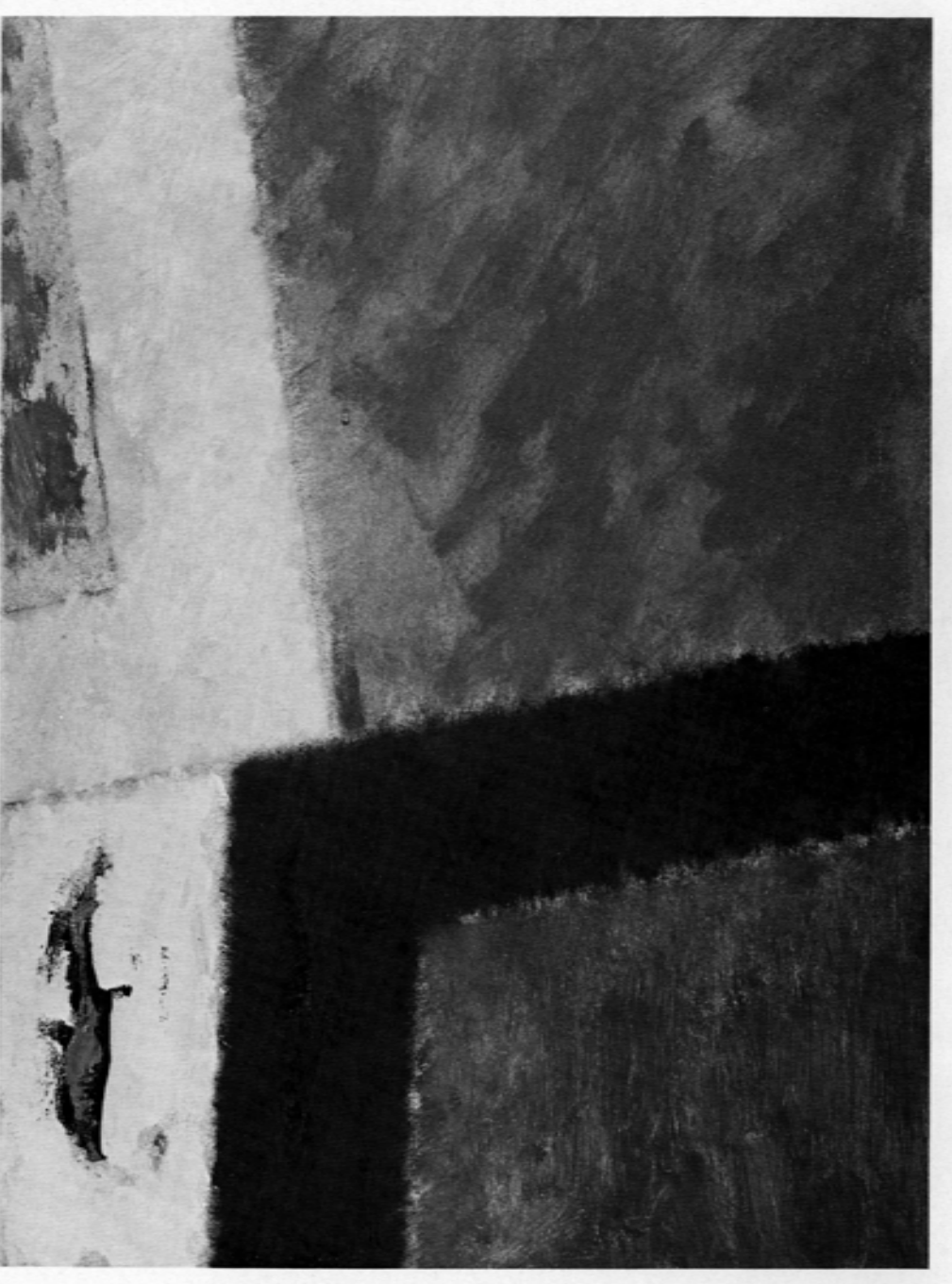
Sliding I, 1988 Oil on canvas, 20x15"