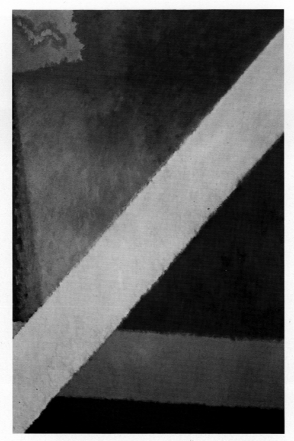
Off Limits, 1987-88 Oil on canvas, 72x48"

Design: Ellen Colcord Stankus Typesetting and printing: Expressway Offset, Plainview, NY