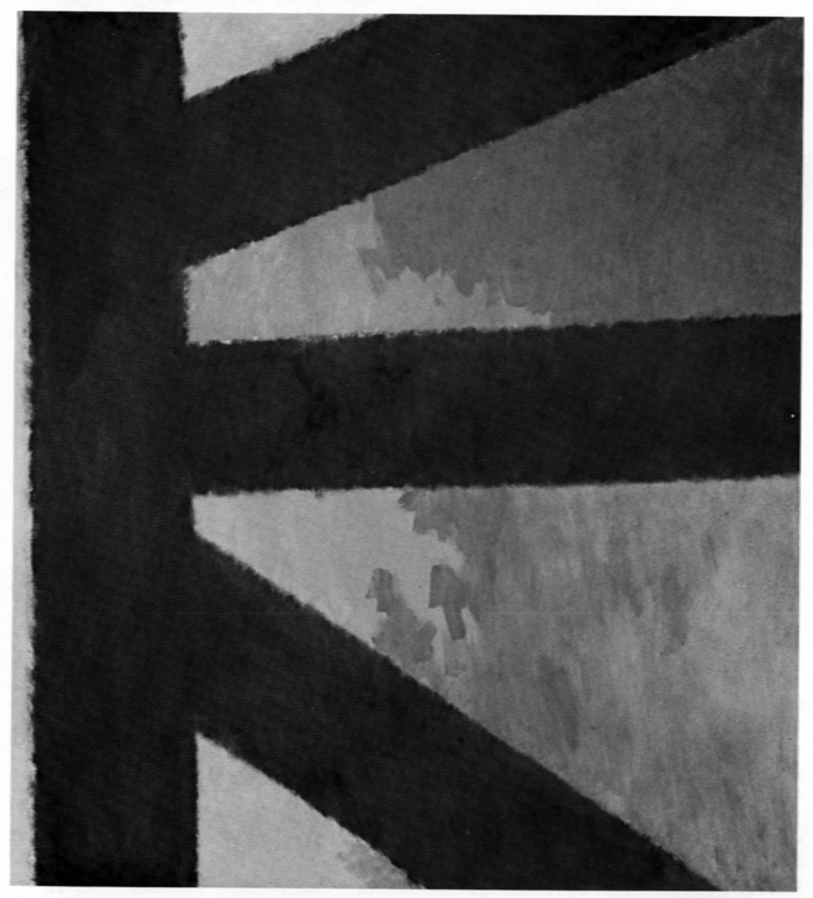
Network IV, 1988 Oil on canvas, 66x60"