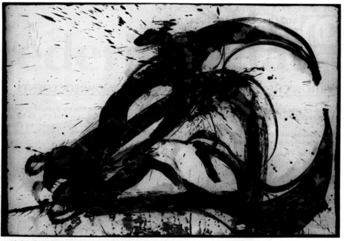
Untitled (Bull's head), 1986