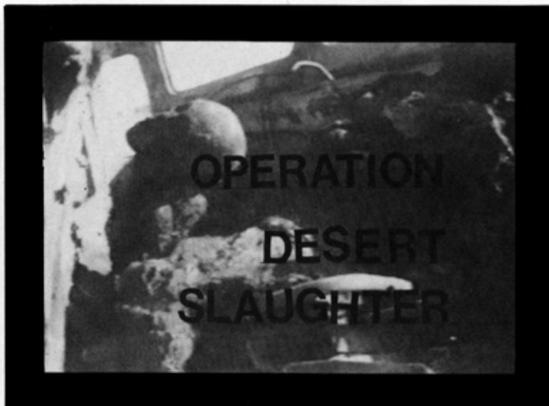
Howardena Pindell War Series: Video Drawing , 1991 (one of thirteen video drawings)

The War Series was inspired by three public television series: 1) Bill Moyers, "The Secret Government: The Constitution in Crisis," 1987; 2) Ali A. Mazuri, "The Africans," 1986; and 3) David Monroe, "The Four Horsemen," 1986. Each series investigated the issues raised by the use of "the Third World" as a battleground while the "superpowers" maintained a facade of peace and prosperity in their own countries (Europe, U.S.S.R., and U.S.A.).