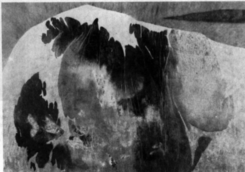
Yan-ping Yang Snow Peak of a Rocky Mountain , 1991