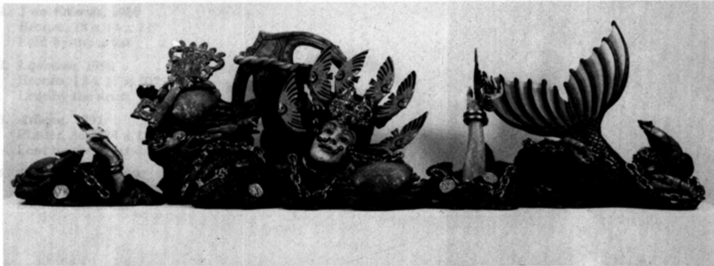
Toby Buonagurio Radiant Creatures of the Blue Coral Sea , 1991