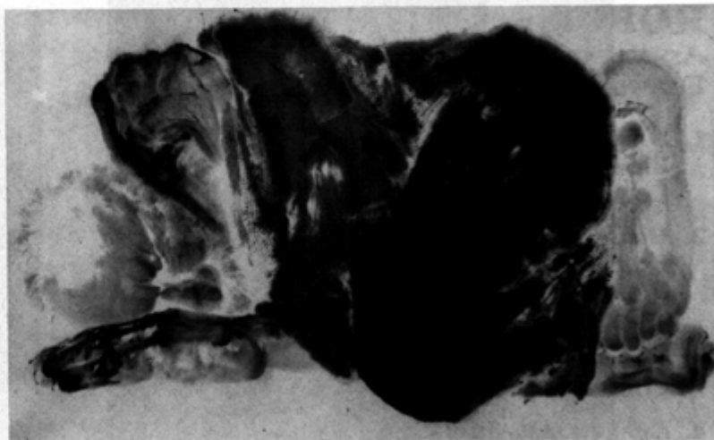
Shan-qing Zeng Slumber , 1991