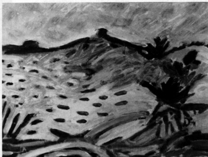
Mel Pekarisky Lucio's Landscape , 1991