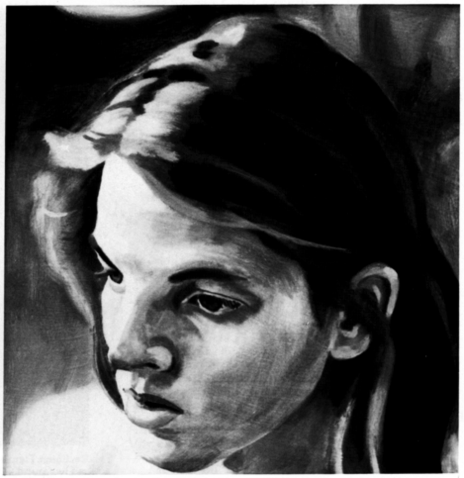
Head, Upper Left, 1991 Oil on paper, 10" x 10"

When I first arrived at Stony Brook my work was oriented to social commentary, striving to bring about a change within society. But to my surprise I found that the work was easily misinterpreted, that the issues were blurred and perhaps some issues weren't for me to discuss. Not to mention that it is a bit grandiose to think that I can change society.