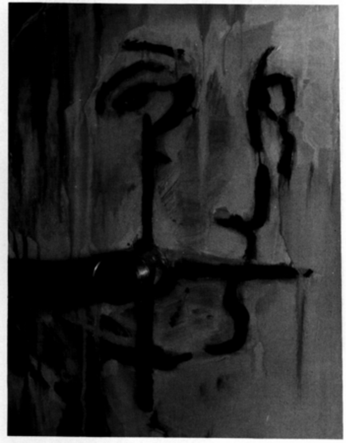
Reclining Figure with Pipes (after Inges, The Grand Odalisque), 1991, Mixed media, 96 x 192"

Aesthetic experience with a work of art is contingent upon the base of experience of the viewer. I am using the body as the source of this work, hopefully finding that the phenomenon of bodily knowledge is experience that we all share. This establishes the interrelatedness with the work, and sets up the space that the body can enter. The facets of this bodily interrelatedness are as follows: