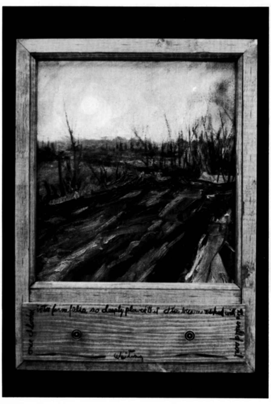
Waiting, 1991 Mixed media, 20 x 13 x 4"

Once I looked into farm fields so deeply plowed that I too became marked with the smell of soil waiting.