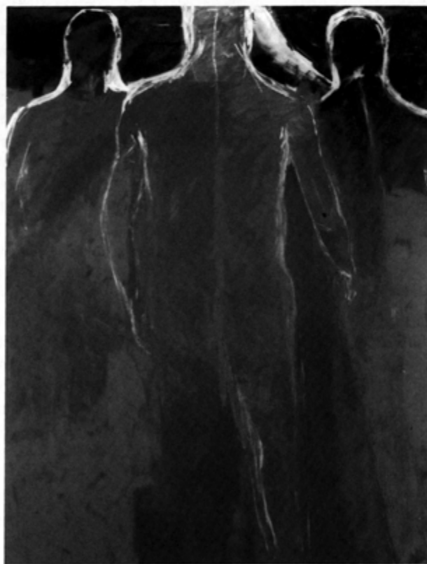
Figures Facing Away, 1988 Oil on canvas, 84 x 65" Lent by the artist

Thus did Julius Tobias start out as a painter in the humanistic, Constructivist mode of Leger, who saw the realities of urban existence—the neon signs and illusionistic billboards thrusting images into public spaces—as abstract pictorial elements to be manipulated at will. Once Tobias recovered from a spate of painting Abstract Expressionist-influenced "black" paintings on his return to New York in 1952, he moved gently back into painting neo-plastic configurations. Abstract, Leger- or Mondrian-like rectangles and bars moving in and out of space predominated, first in gray canvases, then, by the mid-