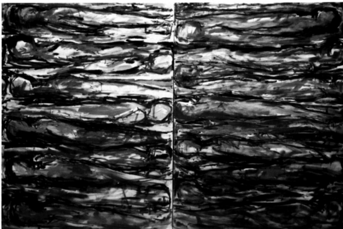
Stacking #1, 1988 Oil on canvas, 90 x 134" Lent by the artist

low walls which rise on a diagonal to meet the first set of two-foot high horizontal walls, five of which then run twenty feet to the end of the forty-six-foot wide room in evenly spaced ranks on either side of the aisle. He also built two cruciform "channel" structures of plywood, one at the Myers Fine Arts Gallery in Plattsburgh, New York, which he painted silver, the other, at 55 Mercer Street, which he left in its natural state. The opening into one arm of the crossing channels is centered on the gallery entrance and the results are particularly dramatic when it opens into the long axis. Coming into the piece in the short arm creates a feeling more maze-like than controlled and processional, but in both cases the emotion generated by these formal configurations is one of being within a sacred precinct.