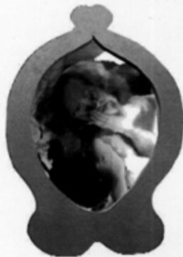
Mirrorland, video still, 2005