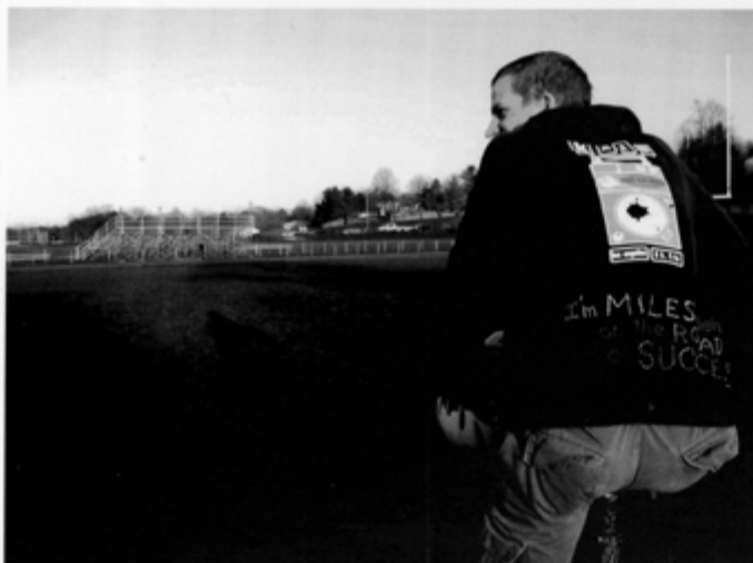
I'm miles ahead on the road to success, inkjet print, 2004

My work explores creating community through art. One major goal of my work is to change people's conception of the consumption of art. Through my shows, I am trying to make each participant both a consumer and a producer of the art. This transformation is manifested in the participants' interaction with one another and myself, their creative activity, and the product of their labor.