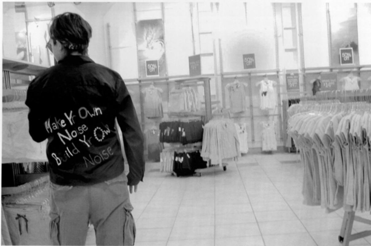
Make Yr Own Noise Build Yr Own Noise, inkjet print, 2004

My work explores creating community through art. One major goal of my work is to change people's conception of the consumption of art. Through my shows, I am trying to make each participant both a consumer and a producer of the art. This transformation is manifested in the participants' interaction with one another and myself, their creative activity, and the product of their labor.