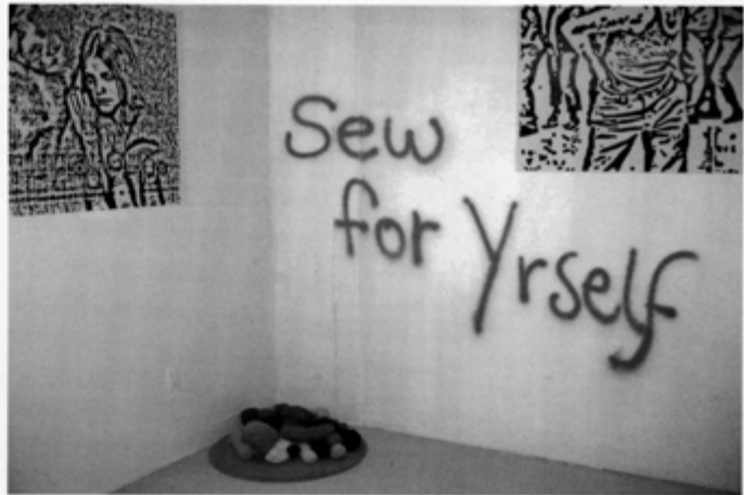
Make Yr Own Noise, installation view, 2004

"Make it yourself. If you just want to watch, fine. That is part of it too. But I think you want to pick up the tools and try it for yourself. Don't worry if it isn't easy, it shouldn't be. You will ask someone for help, people like to be needed. If there is no one there, check out the instructional things around the space – the DVD and books should help. Remember that you are not beholden to make something that looks just like what everyone else is doing. Try to see the nature of what you have before you and see it for what it is – scratchy, stretchy, kitten-soft, hairy, stringy, knotted, patterned, chaotic, perfect. Whatever comes out in the end, remember that you have just done something that could be revolutionary, you made something." G.M.