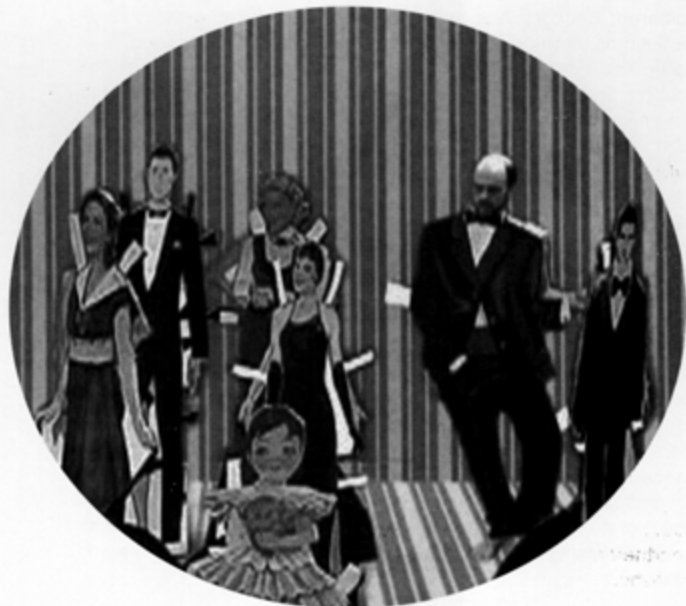
Precut Fashions, Part II, video still, 2005