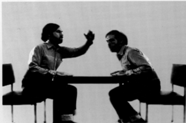
Misrepresentations, Erroneous Conclusions and Ethical Breaches, video stills, 2004-5