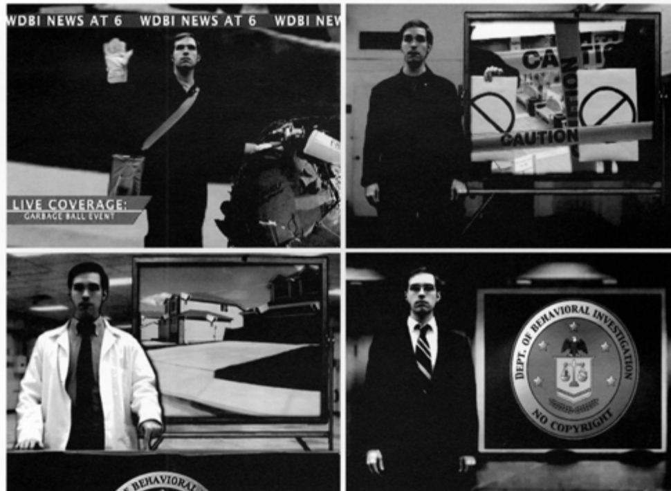
DBI Instructional Video Series, video stills, 2004