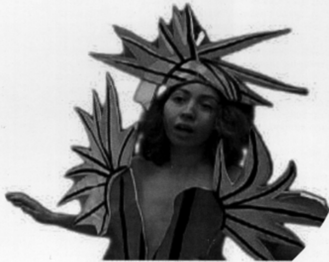
Precut Fashions, Part II, video still, 2005

the silence and ugliness created by the viewer's inability to consider current dehumanizing images of war. In "Precut Fashions," I explore ideas of presumed societal norms about appearance, role, and propriety. Here, our rebellious heroine reconfigures the elements given to her by an outside community.