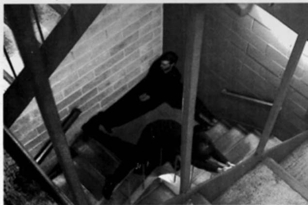
Spatial Relations, video still, 2005

My work explores individual and social behavior in relation to spaces and institutions. My exploration of such themes is split into two sets of projects.