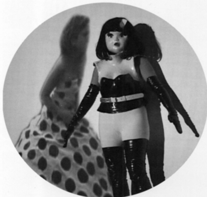
Mirrorland , performance, still from documentation, December 2004

Even though I pursued a classical sculpture education in Turkey, my recent work consists of video, performance, and sculptural props. Conceptually, my work explores the dynamics of power through femininity, often exposing the artifice of symbols of assumed beauty and sex in the globalized world. My solo thesis performance was titled "Mirrorland," which included live performance elements mixed with projected video and props. The narrative dealt with the illusions and power of Western femininity through dressing up and being dressed up by the Statue of Liberty. The video-installation piece "Tainted-Love" compares the visual saturation of popular culture, specifically the 'romance' of Valentine's day, with the cruel imagery of traumatic current events. Within the video, I embody a figure of Western commodification: the attractive and desired delusion. The character I face, literally a man without a face, represents