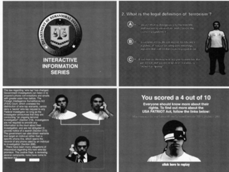
DBI PATRIOT Act Questionnaire, stills from web, 2004