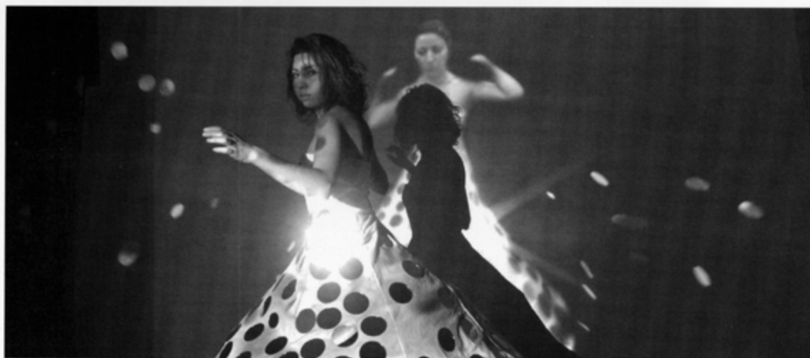
Mirrorland , performance, still from documentation, December 2004

Even though I pursued a classical sculpture education in Turkey, my recent work consists of video, performance, and sculptural props. Conceptually, my work explores the dynamics of power through femininity, often exposing the artifice of symbols of assumed beauty and sex in the globalized world. My solo thesis performance was titled "Mirrorland," which included live performance elements mixed with projected video and props. The narrative dealt with the illusions and power of Western femininity through dressing up and being dressed up by the Statue of Liberty. The video-installation piece "Tainted-Love" compares the visual saturation of popular culture, specifically the 'romance' of Valentine's day, with the cruel imagery of traumatic current events. Within the video, I embody a figure of Western commodification: the attractive and desired delusion. The character I face, literally a man without a face, represents