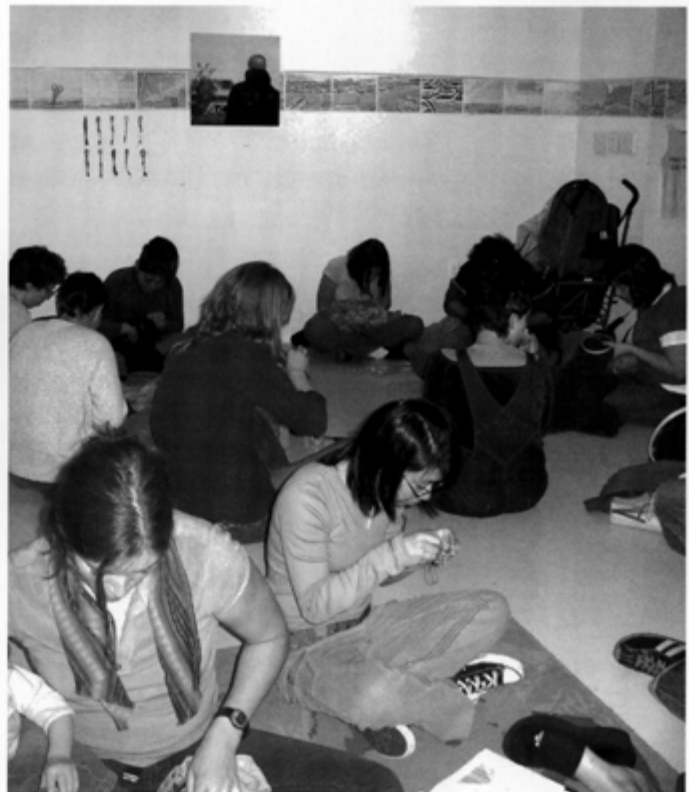
Make It Yr Own event, installation view, 2004