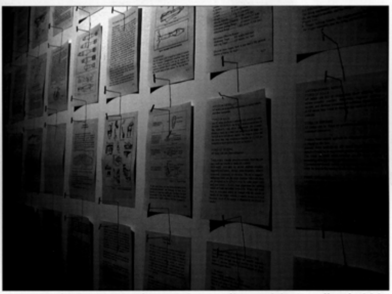
Selections From the American Indian Activist Handbook, 2004

When the Department of Homeland Security was created in late 2001, Native Americans nationwide seized upon the concept as a means to communicate our own struggle with colonization in the Americas. Posters and t-shirts were distributed with the intent of creating dialogues along the lines of, "Whose homeland?" and "Who defines what Terrorism is?"