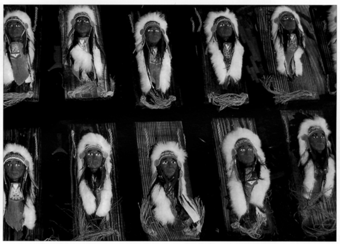
Indios-Adios, mixed media, 2006 (detail)

This piece was born from my participation in and preoccupation with Powwows and Indian Socials for over 20 years. My installation of chief-heads has many different meanings. The heads themselves are hand-made kitsch representing the commercialization and stereotyping of Indians, Indian Art, and Indian Culture. Many contemporary Indian artists are rebelling against this in an attempt to define and articulate their "New Indian Art." I, however, have chosen to use this and create a piece, a configuration which speaks of the many dead Indians and the genocide of our various Indian cultures in the U.S. The piece addresses the simultaneous rejection and co-optation of Indian culture that has occurred after the Holocaust. It also explores the on-going Indian dilemma: