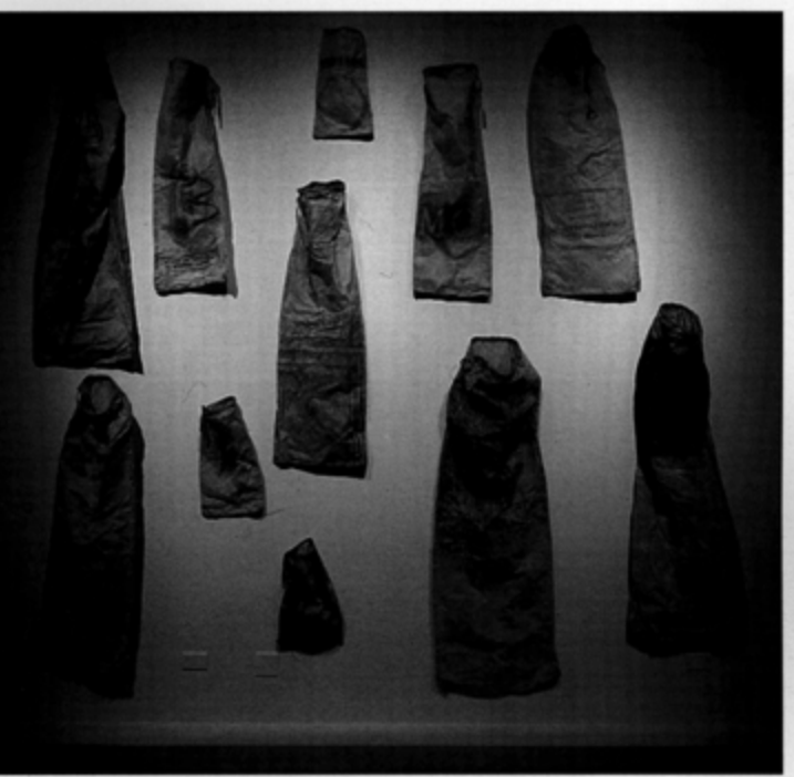
Permanent Title, mixed-media installation, 1993

I began as a painter influenced by European landscape art: Turner and Constable, Barbizon and the Impressionists, Anselm Kiefer. Kiefer's integration of German landscape, history, and myth were crucial for me at a certain stage, as was his use of materials. American landscape art was equally important: the Hudson River School painters but also Robert Smithson's work and writings.