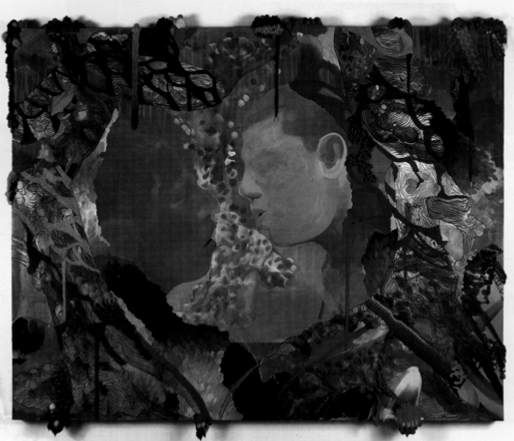
State of Emergency, oil and pigmented silicone on wood panel, 2005

The two paintings, All That Matters and State of Emergency , came from a series that depicted figures in a lush utopian environment. I wanted the people in this land to be uninhibited and enjoying the pleasures of the land and of each other, nothing more. This may sound simple and escapist, but I felt it was important for me to visualize what this kind of environment looked like and imagine what happens there in order for me to begin to push further into less idyllic visions of developing society. In the utopian environment, abundance and beauty champion all. One painting shows a woman who is totally immersed in her relationship with her child. The other shows two men just about to kiss. It was important to me to include all types of people and relationships in this environment, in a non-judgmental and non-hierarchal way.