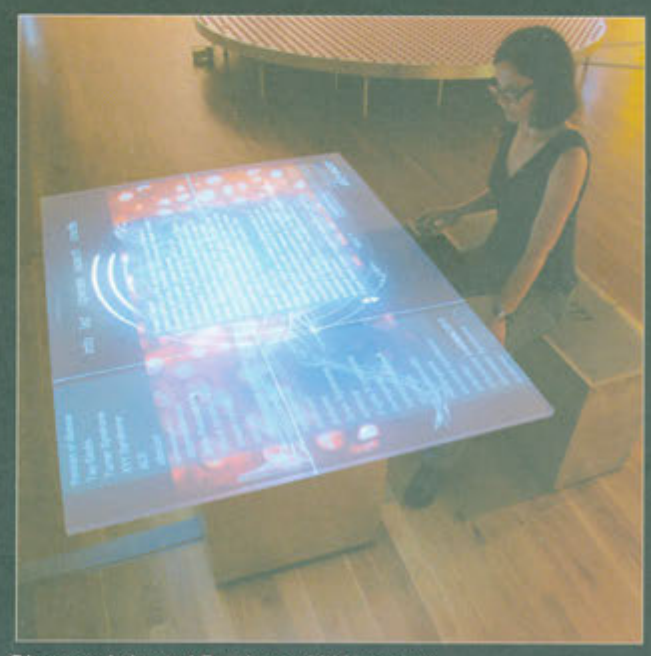
Dis-ease, Animated Database, 2003-present