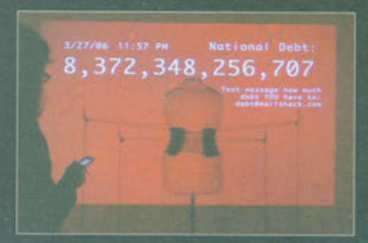
Debt Reducer, Cell Phone Interactive Installation, 2007