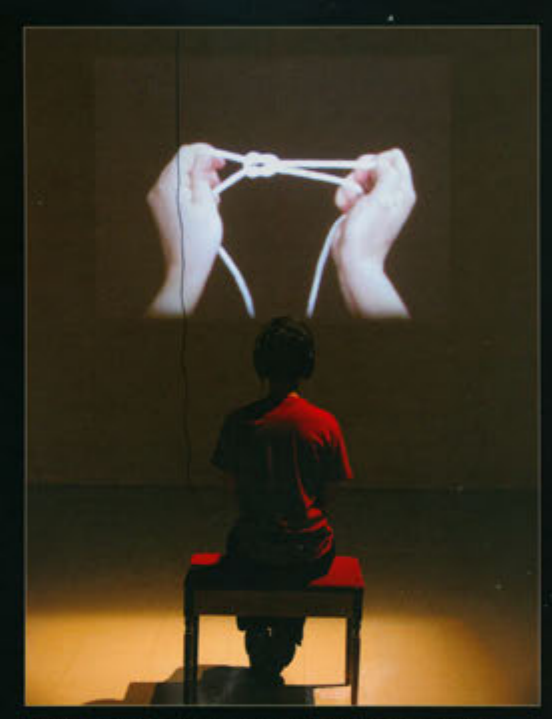
REplay Series: Rewind, Interactive Video, 2002