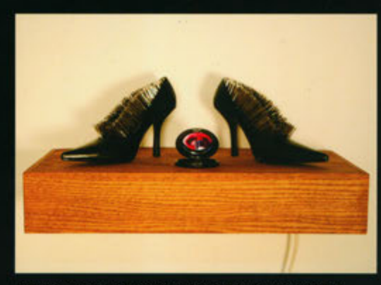
REplay Series: Femme, Video Sculpture, 2005-6