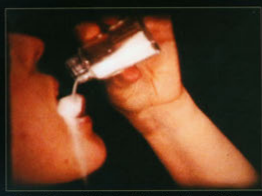
REplay Series: Salteater, Video Sculpture, 2002