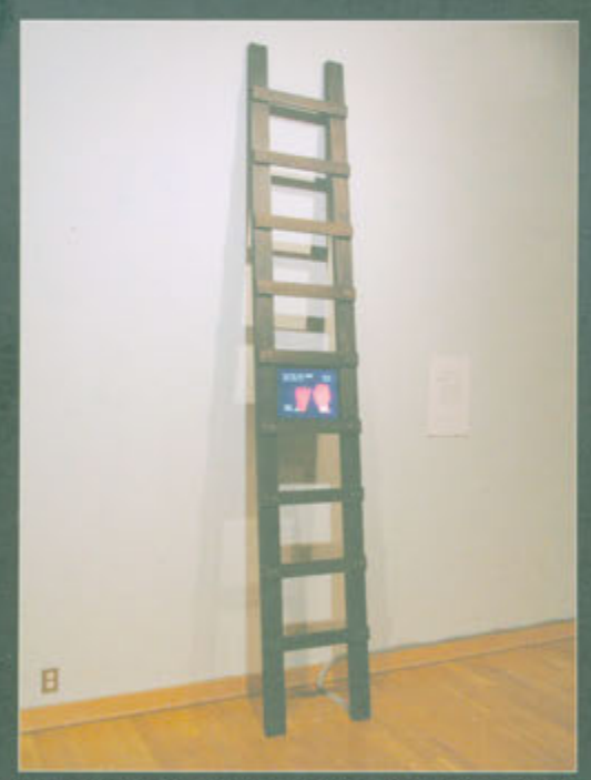
Eternal Climb, Stock Market Driven Installation, 2004-5

Cover Images top: Search, 2005-7 center: Mnemonic Devices - Seesaw, 2000-7 bottom: Dis-ease, 2003 - present