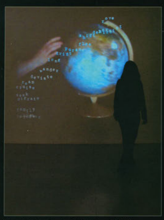
Search, Video Tracking Installation, 2005-7