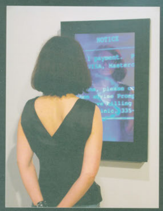
Dataskins, Interactive Installation, 2000-5