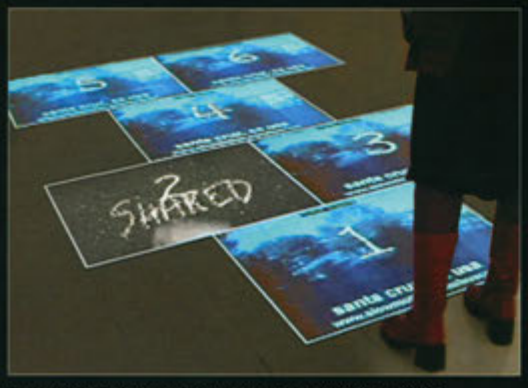
Learning Distance, Webcam Installation, 2001