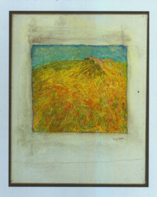
High Place, 2010 Oil and pencil on canvas, 10 x 8"

Professor Emeritus Painting, Drawing, Public Art, and Art Theory