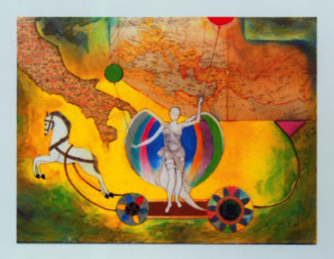
Nike Chariot, 2010 Drawing, collage, and mixed media, 27 x 21"