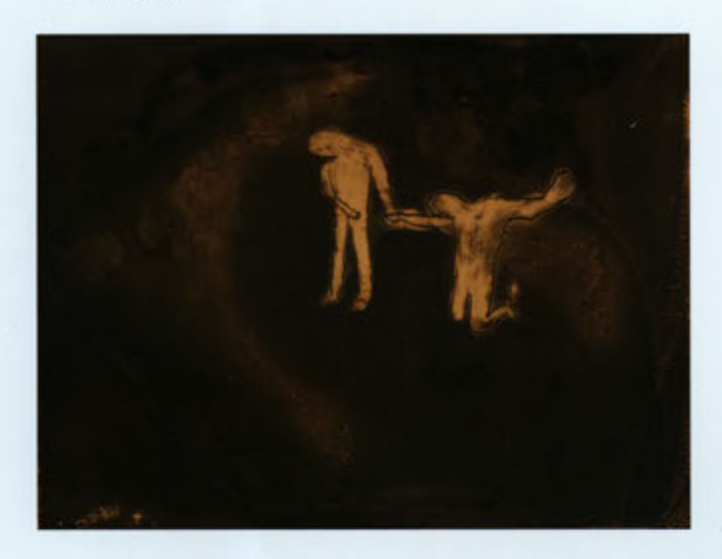
Untitled from the series Entangled with Justice, 2009 Unique, toned Polaroid Type 55 negative, 3% x 4%"