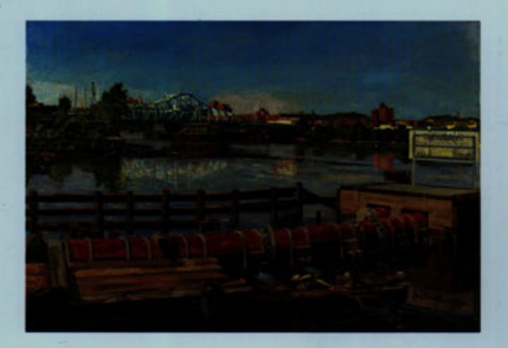
Across the Harlem River, 2008 Oil on linen, 25 x 36"