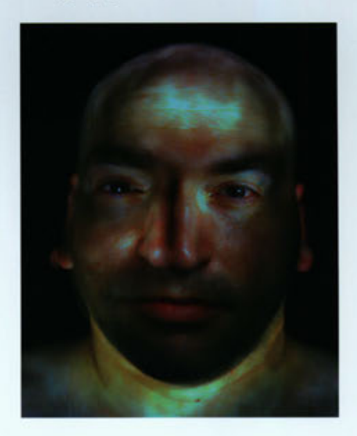
William, 2008 Pigmented ink on paper, 10 x 8"