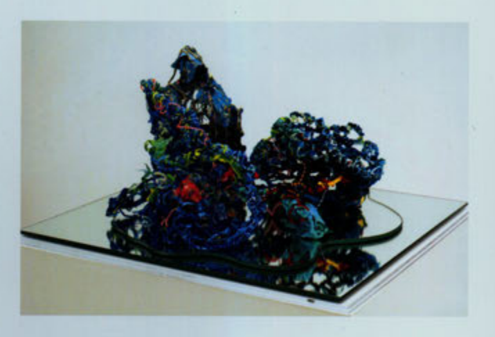
Sing City, 2009 Sculpture, 12 x 20 x 22"

Assistant to the Director, Pollock-Krasner House and Study Center, East Hampton, NY Painting and Sculpture