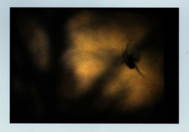
Captives, 2010 Digital video, 9:00 minutes