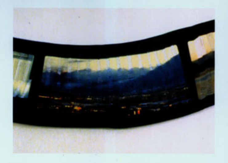
Switzerland (Train), 1991 (detail) Acrylic and Cibachrome prints on board, 10½ x 55¾"