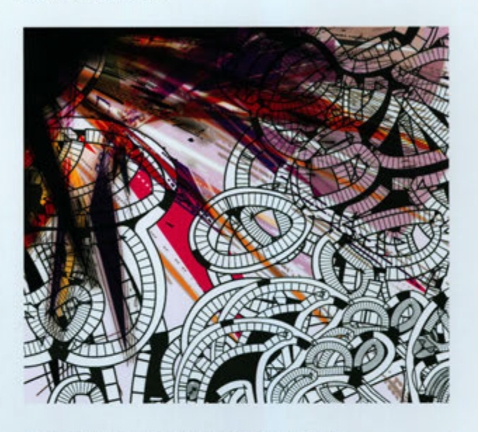
20 Love Songs and a Song of Despair, 2010 Mixed media, iPod, sound, and video Dimensions variable

Assistant Professor, Music and Consortium for Digital Arts, Culture, and Technology Sound Installation