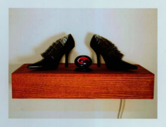
REplay Series: Femme, 2005–2006 Video sculpture

Associate Professor; Director of the Consortium for Digital Arts, Culture, and Technology Physical Computing Installation, Digital Media, and Video