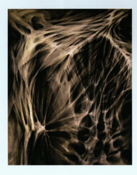
Dorsal Cleft, 2009 Charcoal and watercolor on paper, 54½ x 42½"