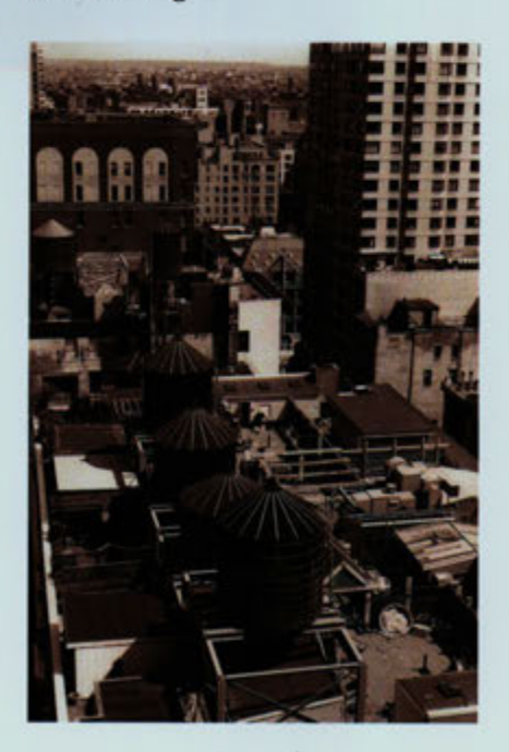
Big Brothers, Little Sisters, 2010 Aquatint etching, 13 x 8½"

Professor and Undergraduate Program Director Printmaking