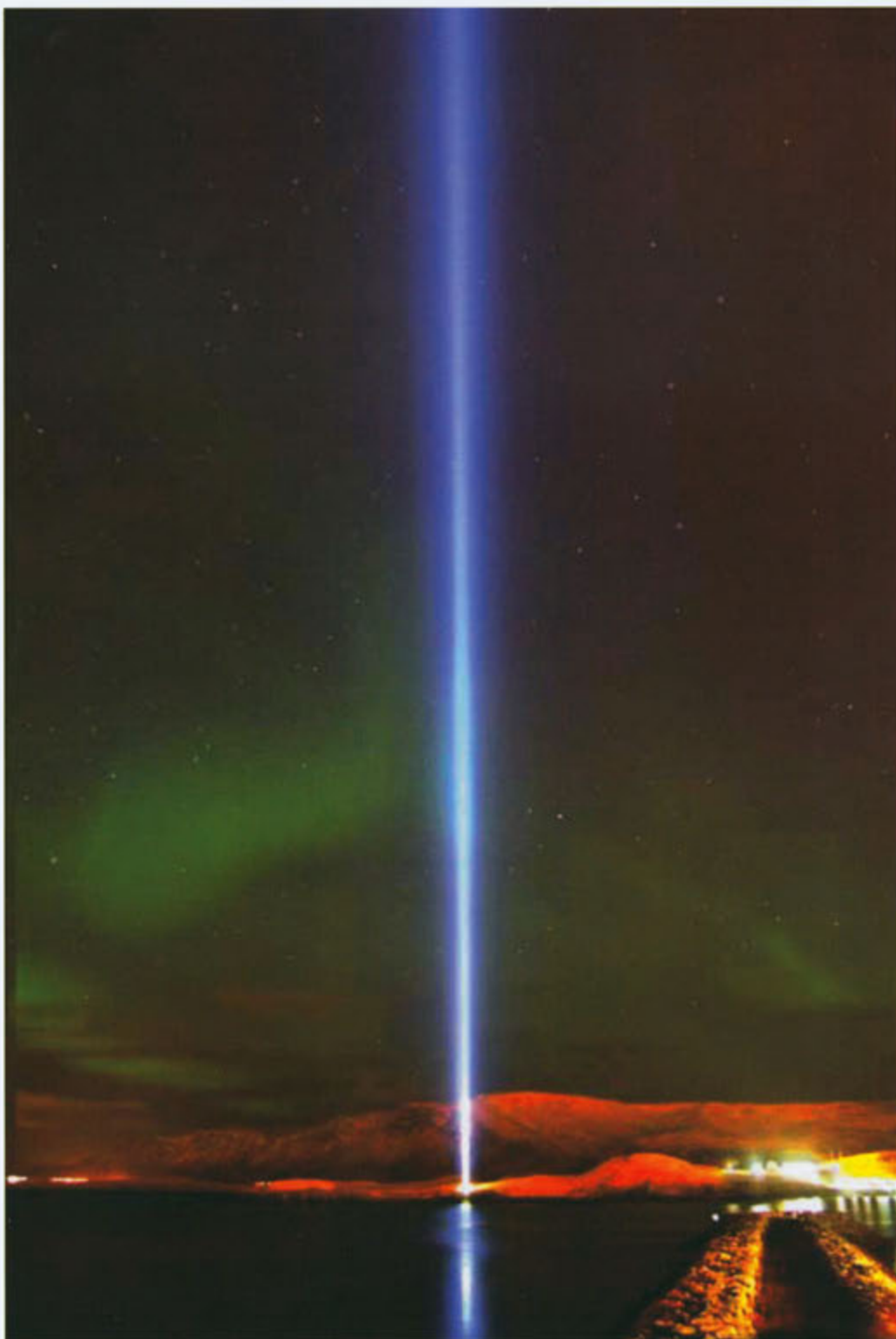
Yoko Ono IMAGINE PEACE TOWER 2006/2011 Videy Island, Reykjavik, Iceland Courtesy of Yoko Ono