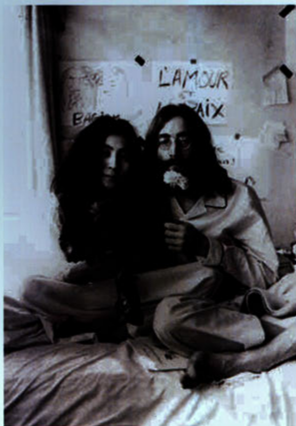
John Lennon & Yoko Ono Montreal Bed-In, 1969