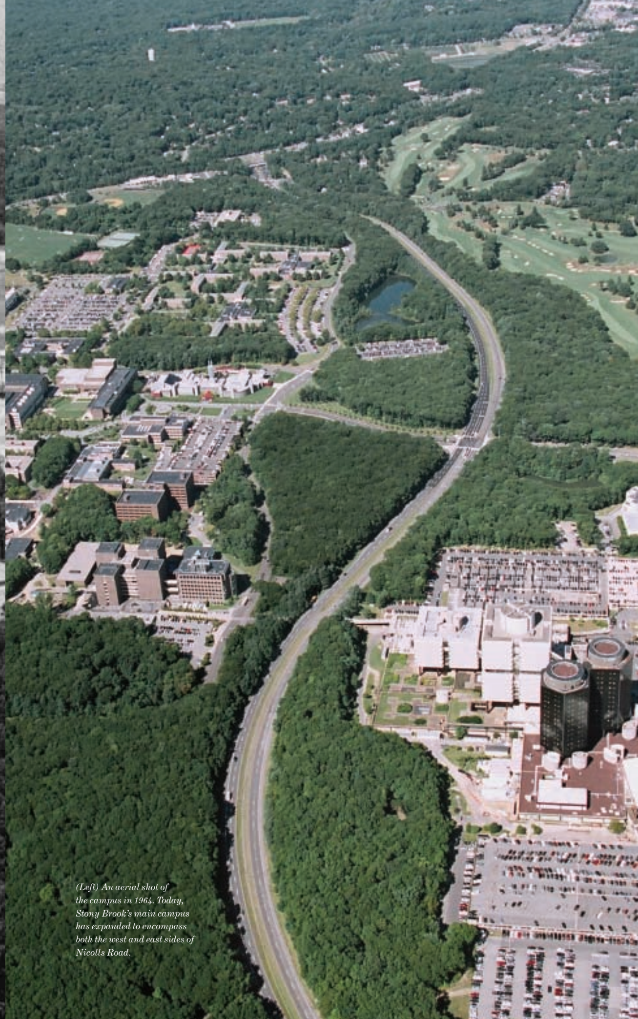
(Left) An aerial shot of the campus in 1964. Today, Stony Brook's main campus has expanded to encompass both the west and east sides of Nicolls Road.