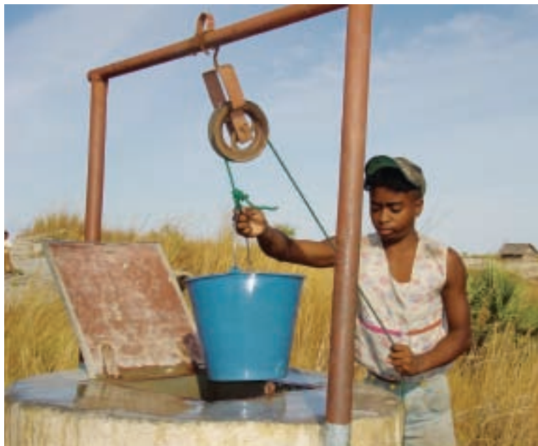
Stony Brook researchers help impoverished villages in Madagascar by constructing wells for clean water.