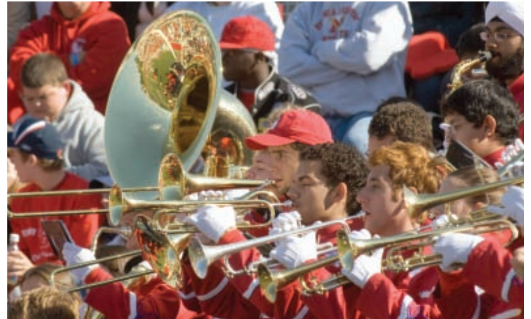
(Top) In its second year, the Red Hot Marching Band is spreading Stony Brook pride at home football games and campus events.

You can see it in the three Nobel Prize winners connected to Stony Brook, the Fields medalist, winners of United States Presidential medals, MacArthur