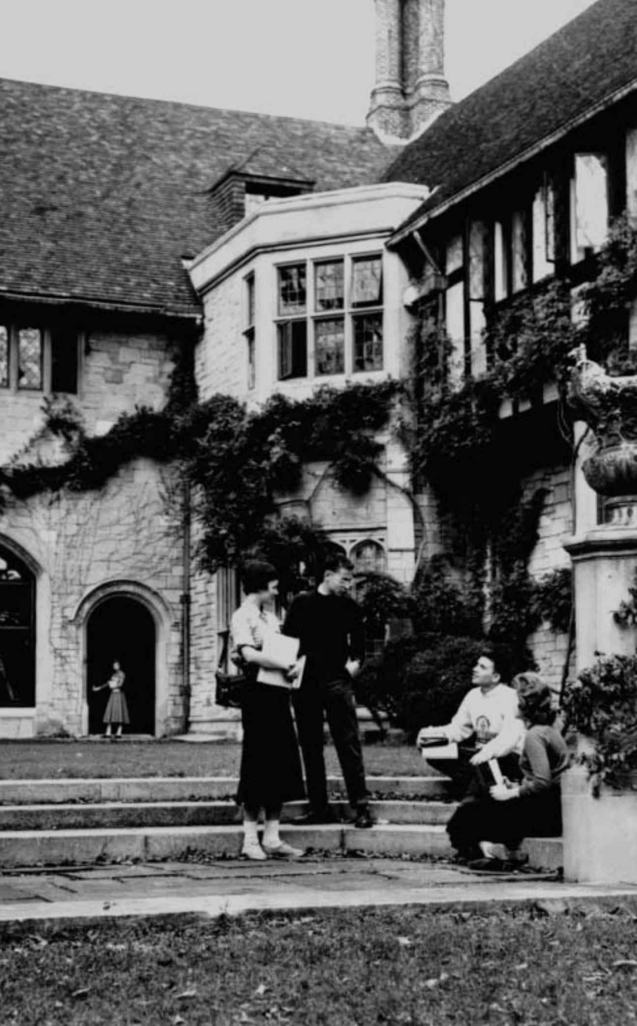
Students outside Coe Hall at the Planting Fields in Oyster Bay, the site of Stony Brook University's first campus.