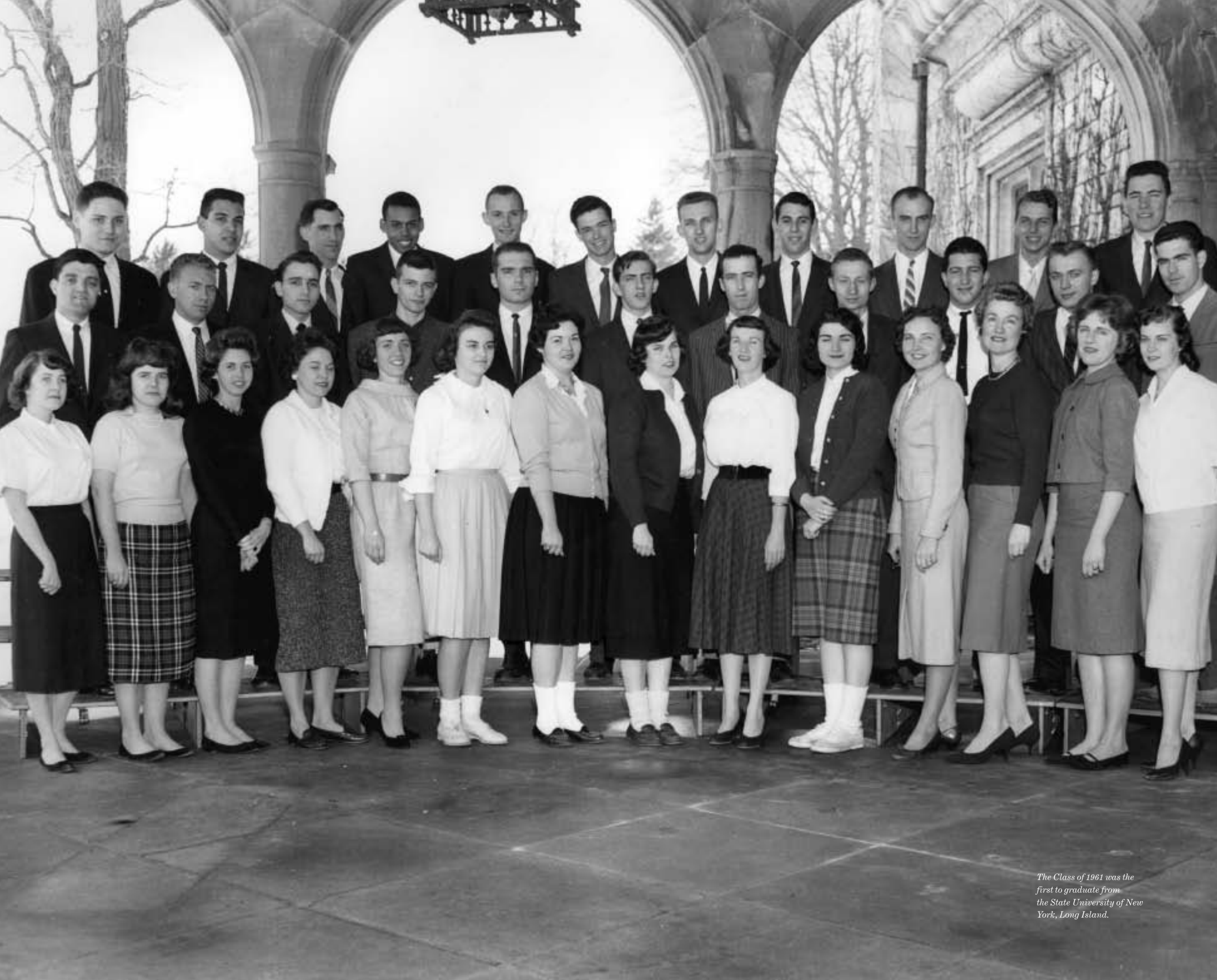
The Class of 1961 was the first to graduate from the State University of New York, Long Island.