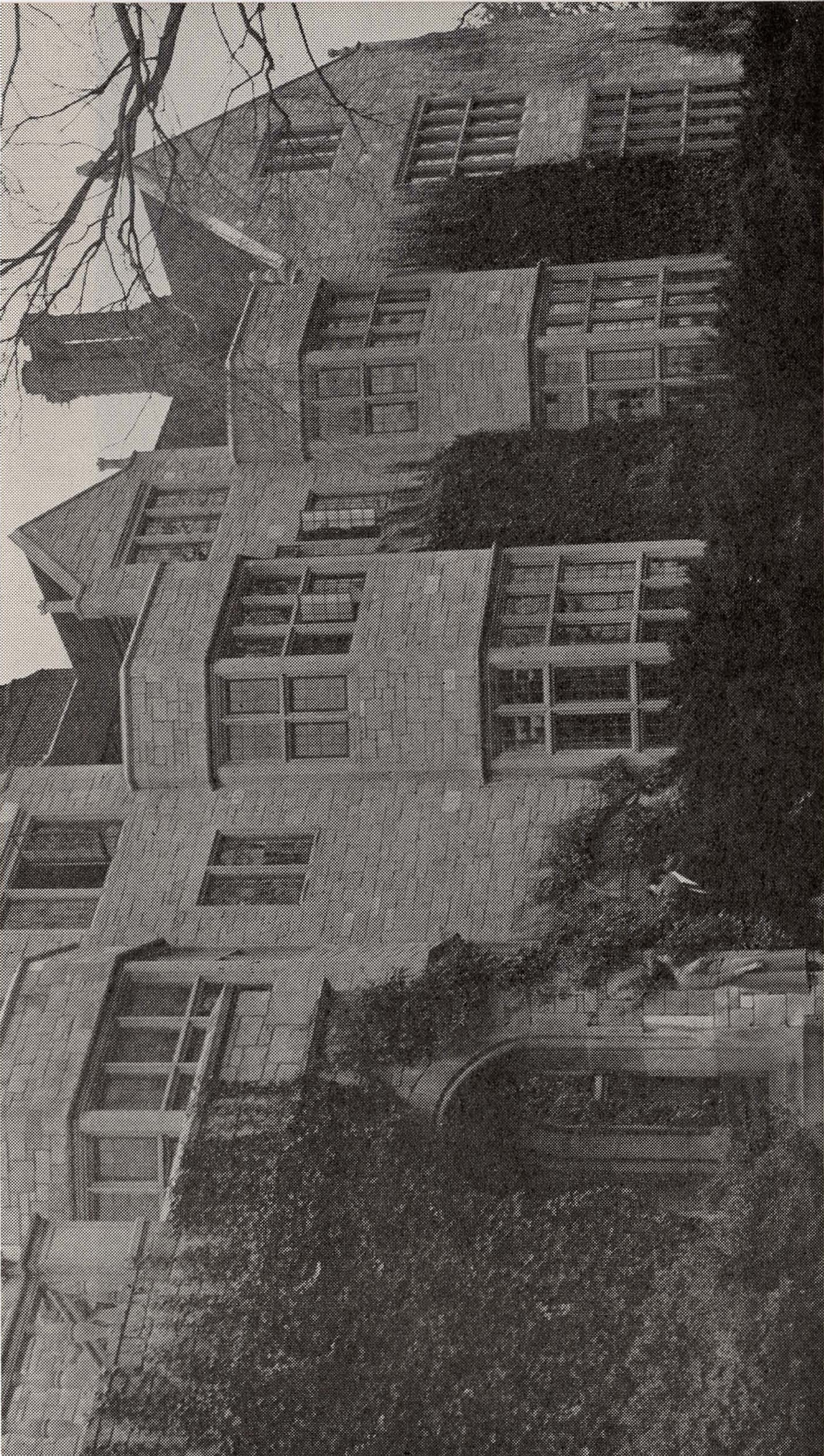
A VIEW OF COE HALL