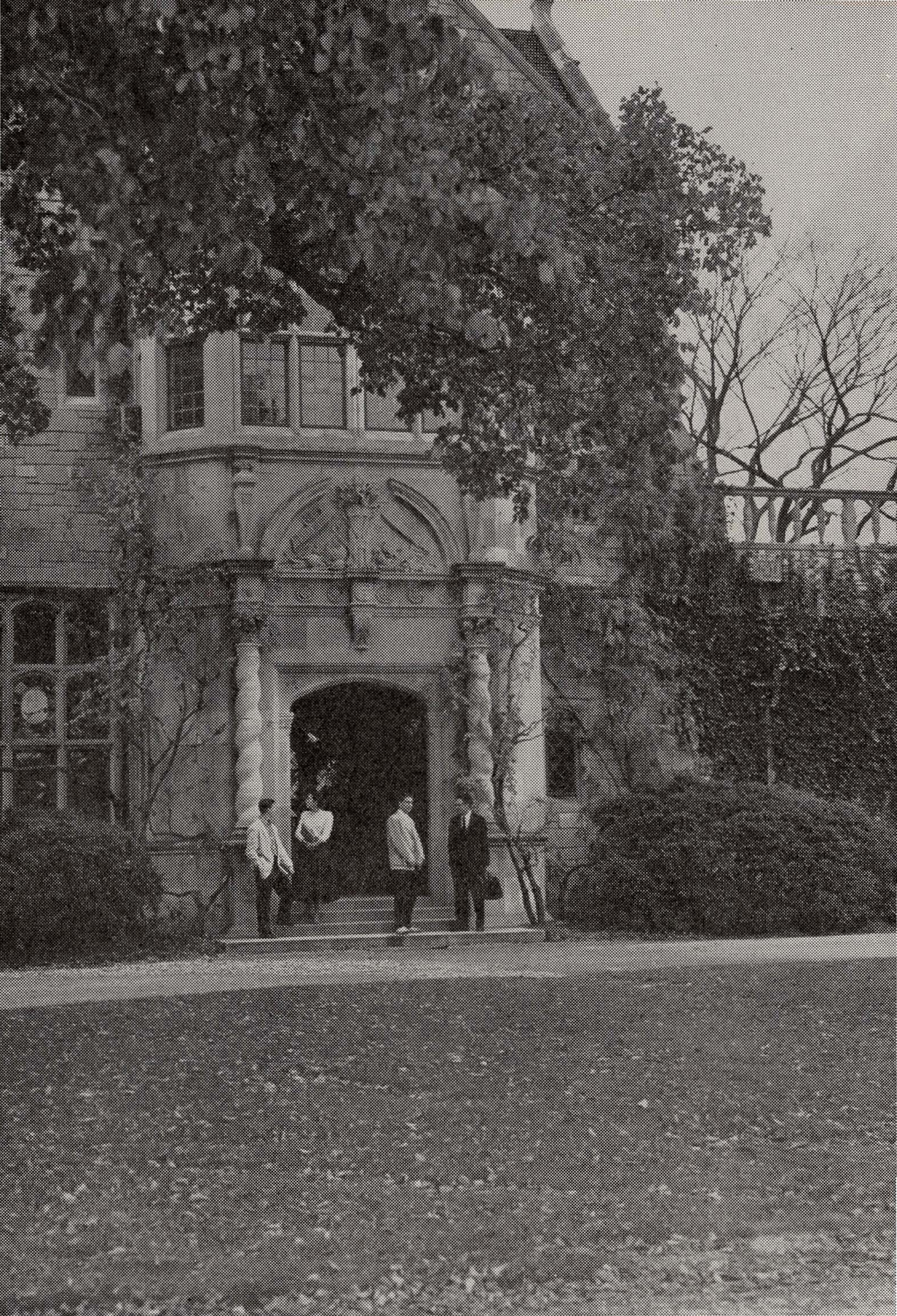
ENTRANCE TO COE HALL