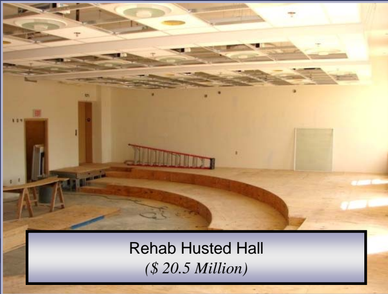
Rehab Husted Hall ($ 20.5 Million)