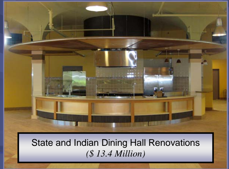
State and Indian Dining Hall Renovations ($ 13.4 Million)