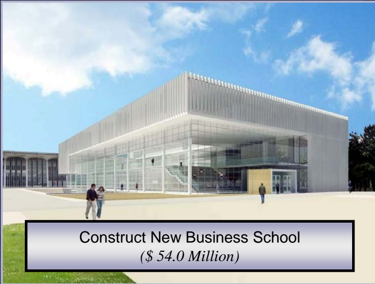
Construct New Business School ($ 54.0 Million)