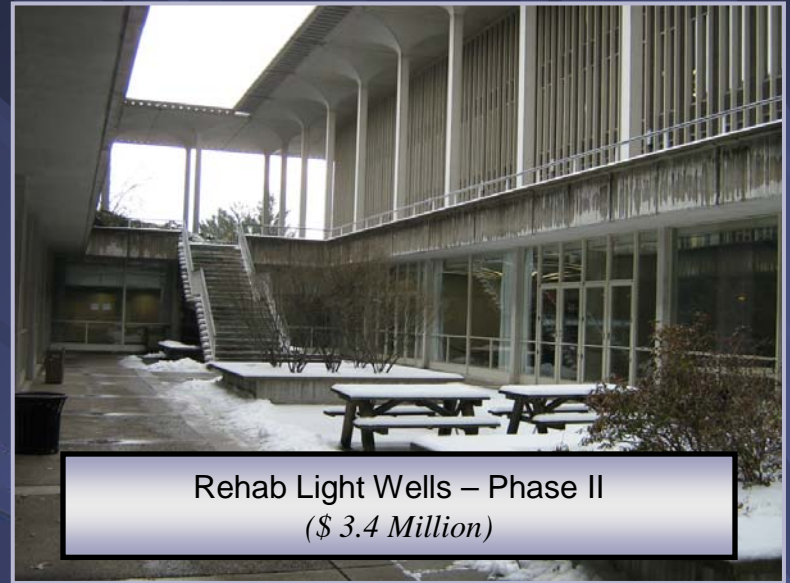
Rehab Light Wells – Phase II ($ 3.4 Million)