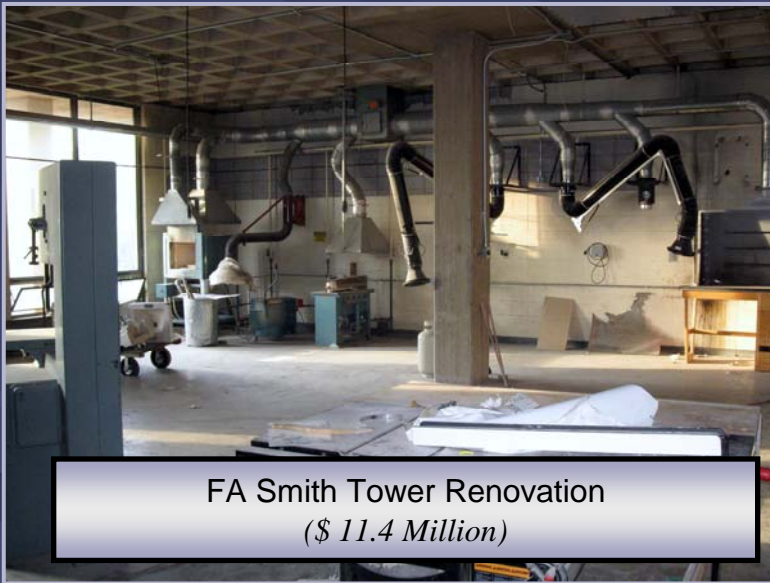
FA Smith Tower Renovation ($ 11.4 Million)