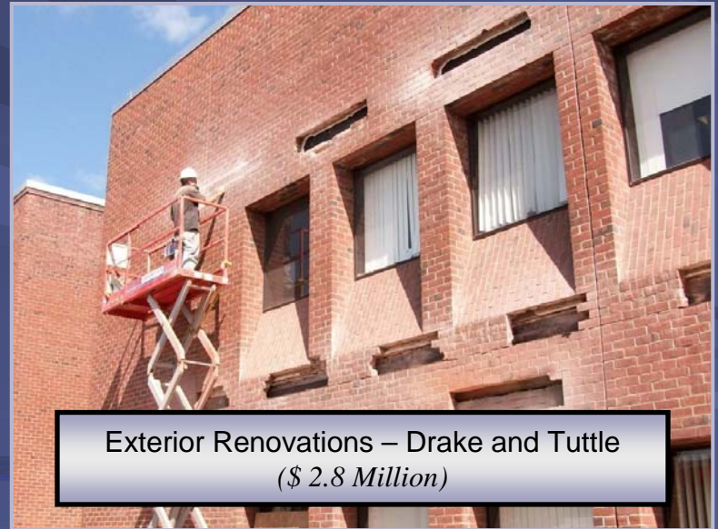
Exterior Renovations – Drake and Tuttle ($ 2.8 Million)