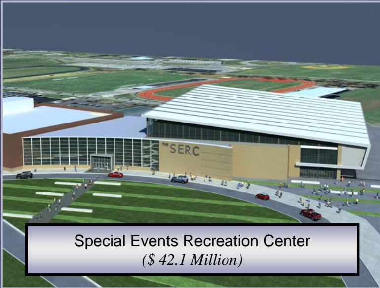
Special Events Recreation Center ($ 42.1 Million)