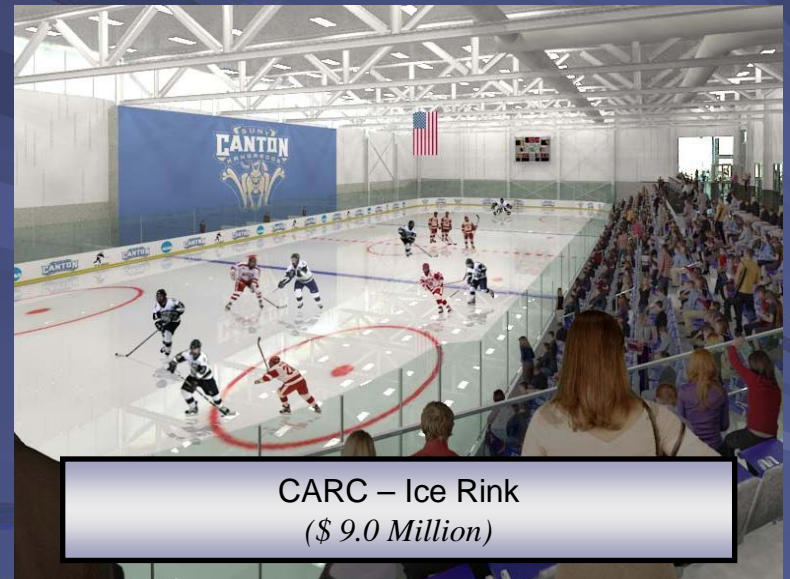
CARC – Ice Rink ( $ 9.0 Million )