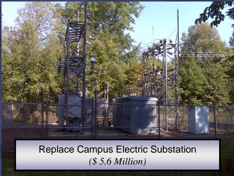
Replace Campus Electric Substation ( $ 5.6 Million )