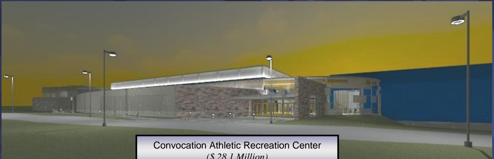
Convocation Athletic Recreation Center ( $ 28.1 Million )