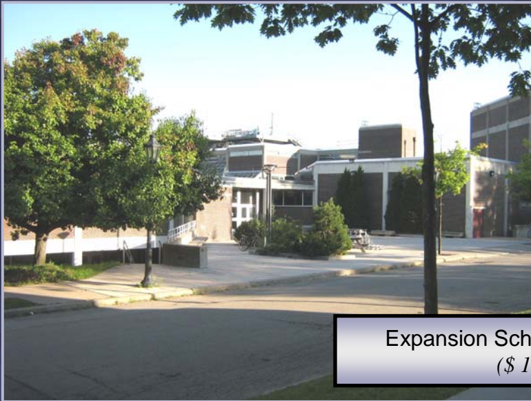
Expansion School of Arts and Design ($ 10.0 Million)