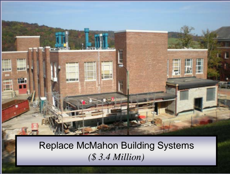
Replace McMahon Building Systems ($ 3.4 Million)