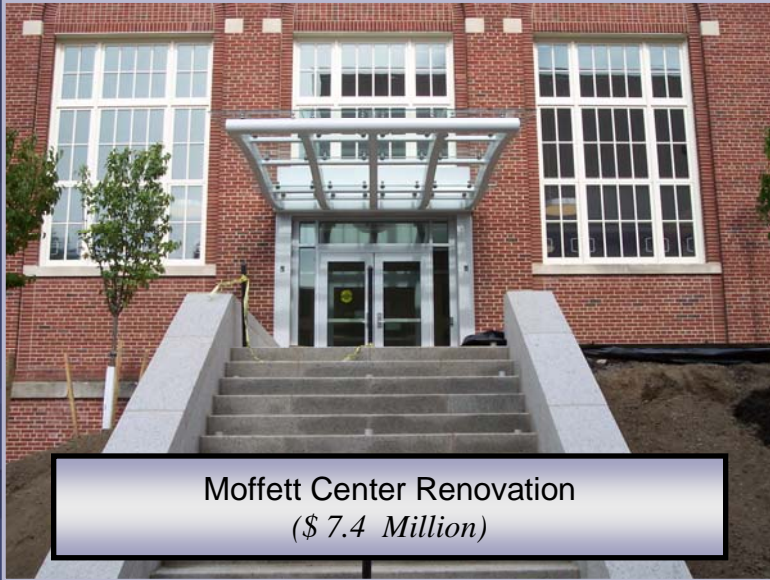
Moffett Center Renovation ($ 7.4 Million)