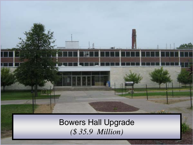
Bowers Hall Upgrade ($ 35.9 Million)