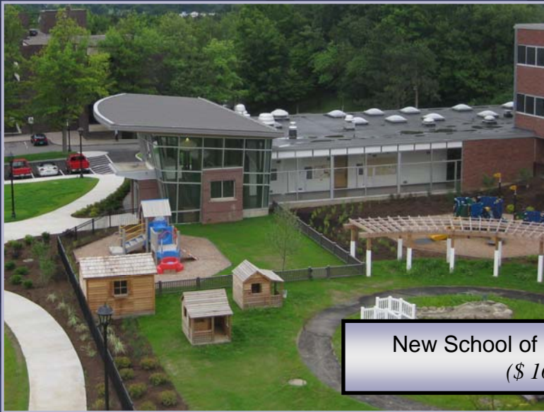
New School of Education / Child Care ($ 16.3 Million)