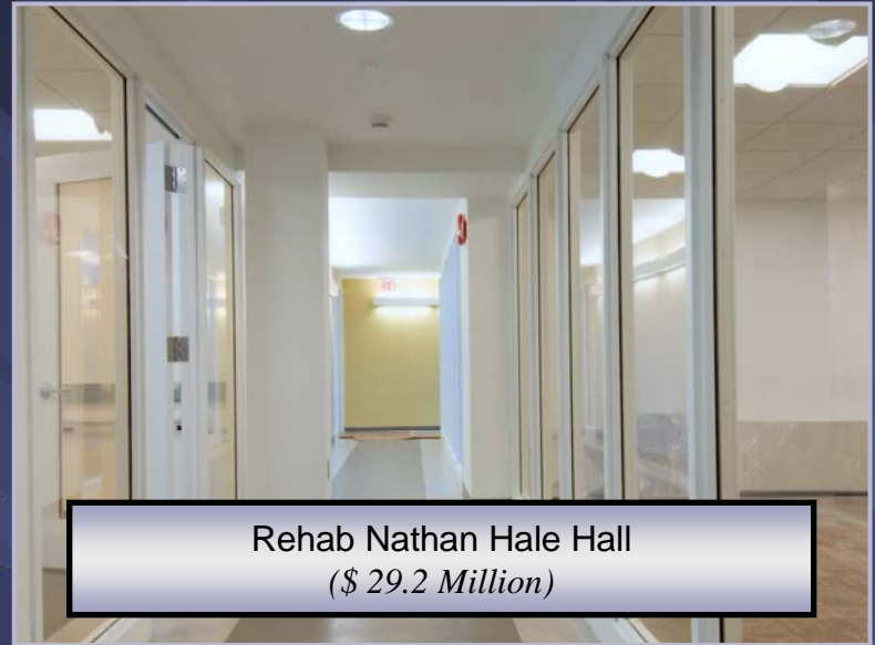
Rehab Nathan Hale Hall ($ 29.2 Million)