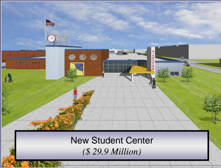
New Student Center ($ 29.9 Million)