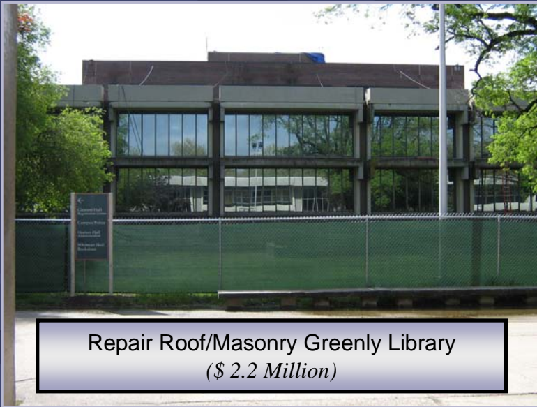
Repair Roof/Masonry Greenly Library ($ 2.2 Million)