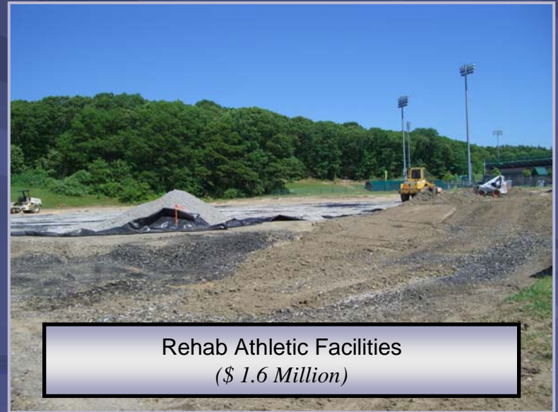
Rehab Athletic Facilities ($ 1.6 Million)