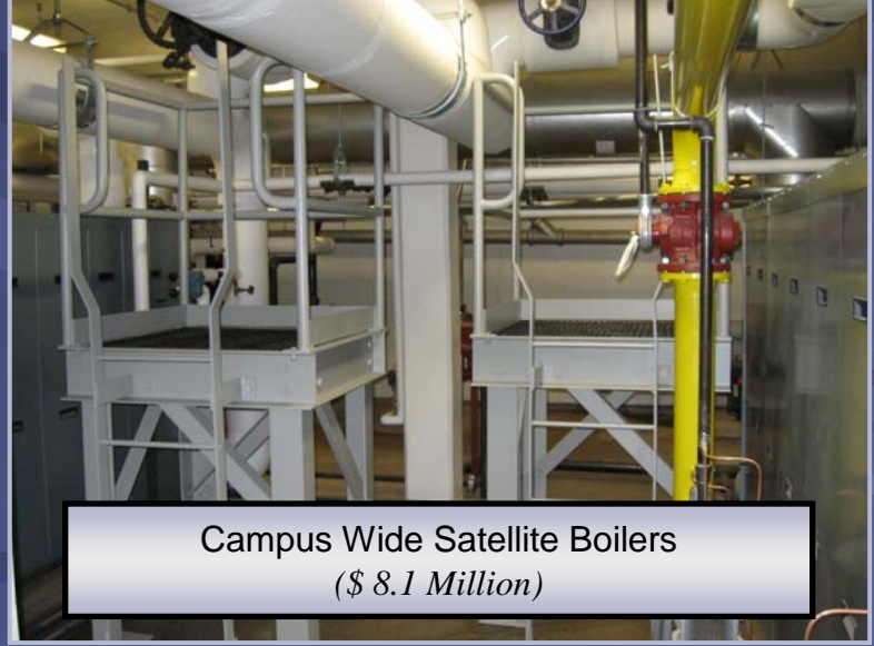
Campus Wide Satellite Boilers ($ 8.1 Million)