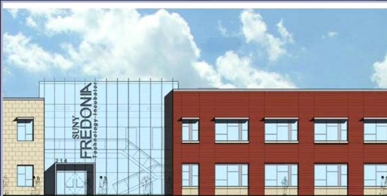
High Tech Incubator ($ 5.7 Million)