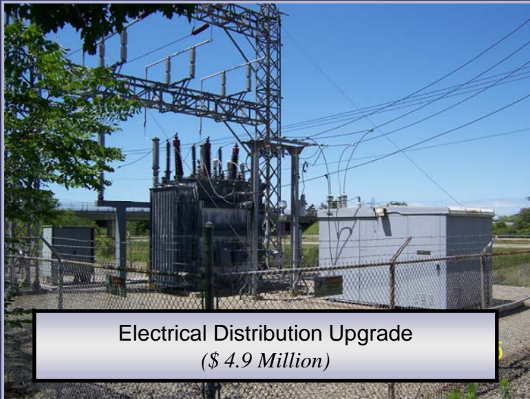
Electrical Distribution Upgrade ($ 4.9 Million)