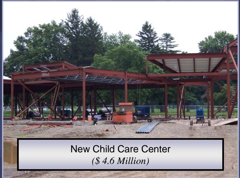
New Child Care Center ($ 4.6 Million)