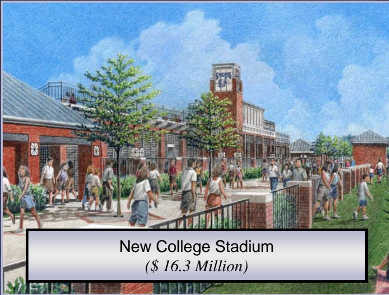
New College Stadium ($ 16.3 Million)