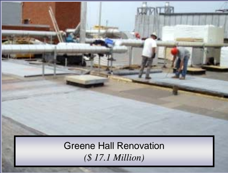
Greene Hall Renovation ($ 17.1 Million)