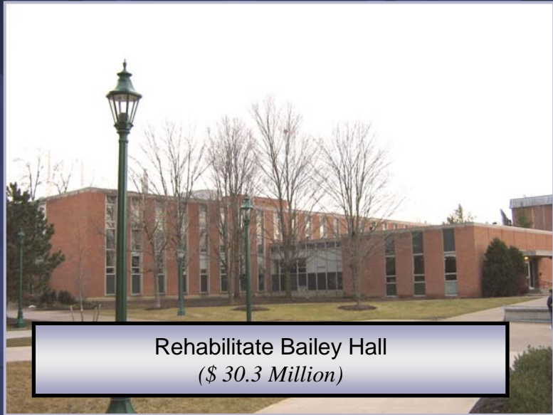
Rehabilitate Bailey Hall ($ 30.3 Million)