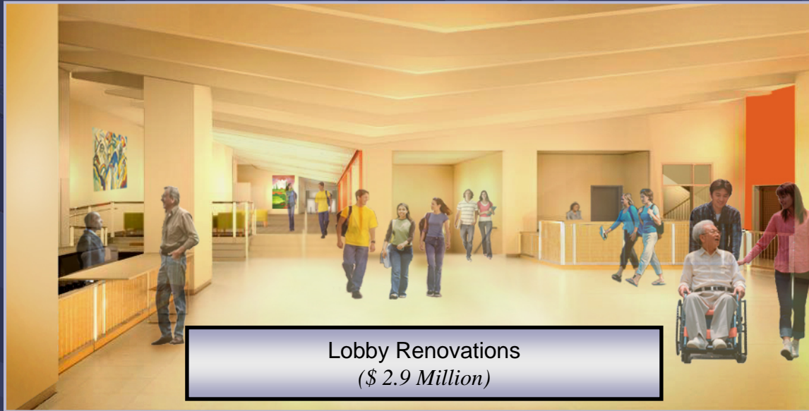
Lobby Renovations ($ 2.9 Million)