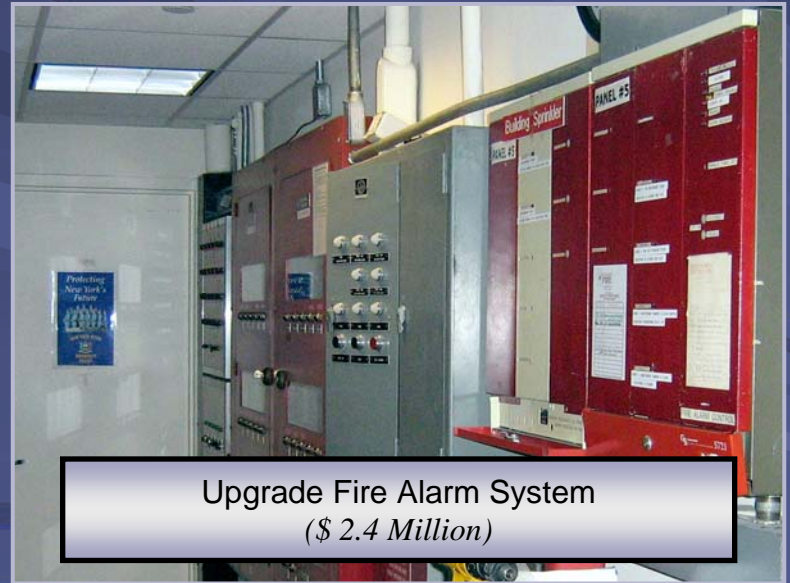
Upgrade Fire Alarm System ($ 2.4 Million)