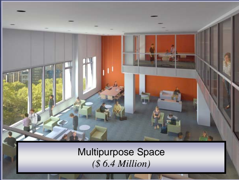
Multipurpose Space ($ 6.4 Million)