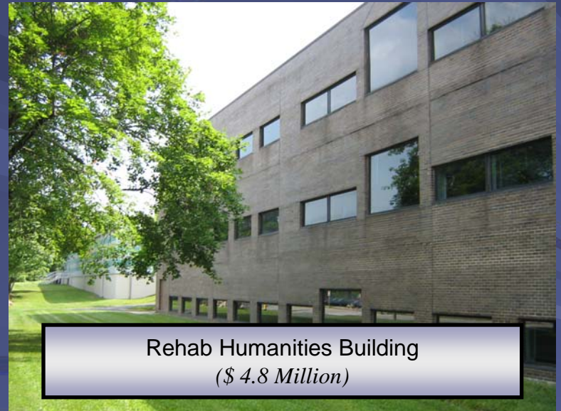
Rehab Humanities Building ( $ 4.8 Million )