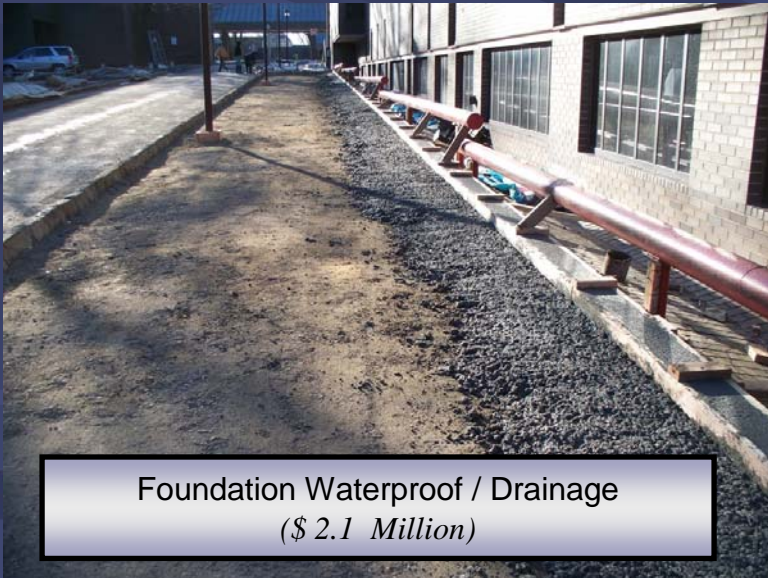
Foundation Waterproof / Drainage ( $ 2.1 Million )