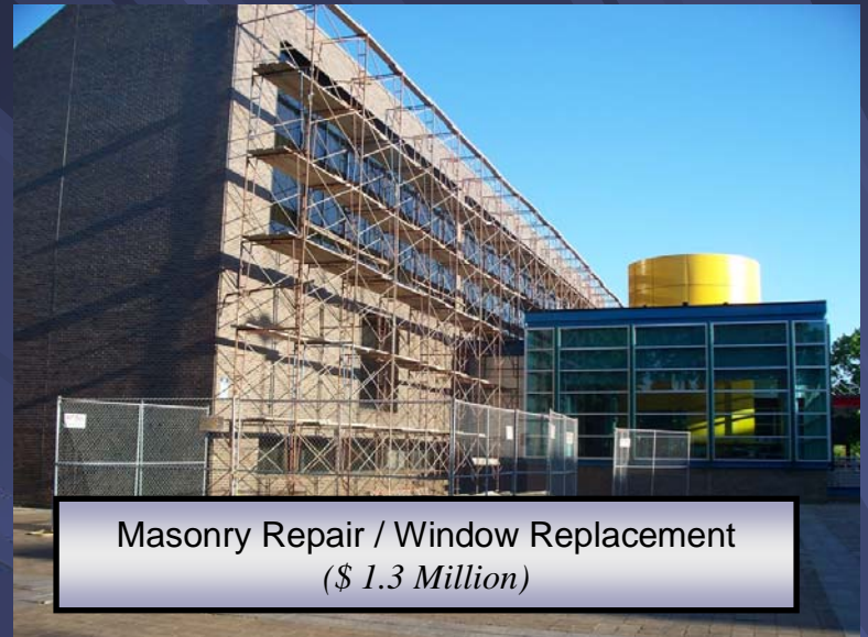
Masonry Repair / Window Replacement ( $ 1.3 Million )