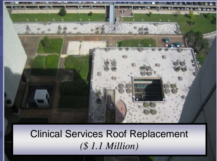
Clinical Services Roof Replacement ($ 1.1 Million)