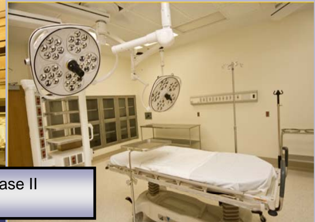
Major Modernization – Phase II ($ 25.7 Million)