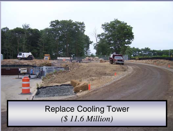
Replace Cooling Tower ($ 11.6 Million)