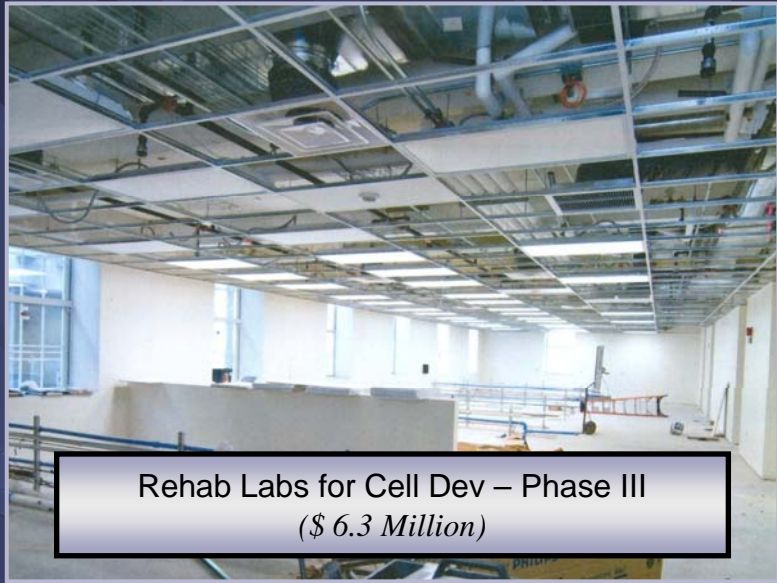
Rehab Labs for Cell Dev – Phase III ($ 6.3 Million)