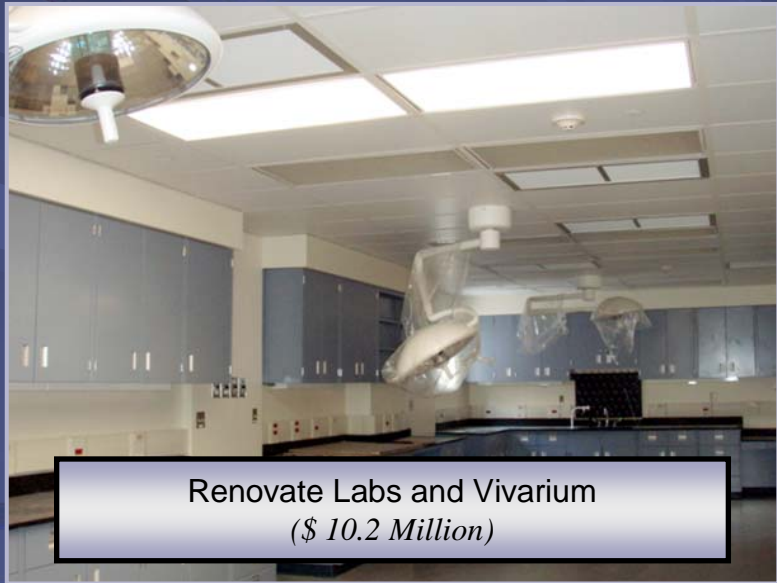
Renovate Labs and Vivarium ($ 10.2 Million)