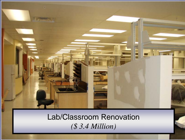
Lab/Classroom Renovation ($ 3.4 Million)