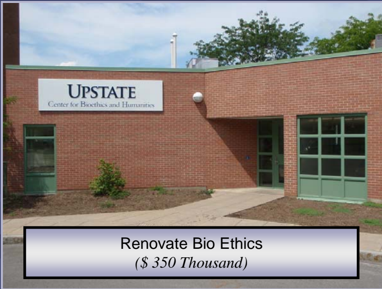
Renovate Bio Ethics ($ 350 Thousand)