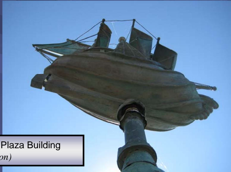
Exterior Renovation – Plaza Building ($ 6.3 Million)