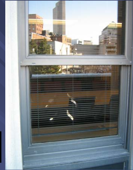
Window Replacement – Building 5 ($ 2.1 Million)