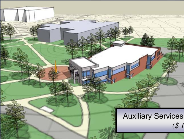
Auxiliary Services Building / Student Center ($ 15.7 Million)