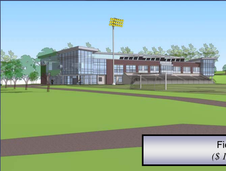
Field House ($ 18.4 Million)