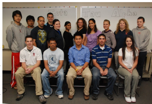
Alpha Nu Initiation 2009

ITA is in the process of organizing community discount cards, in which local community organizations agree to pro-