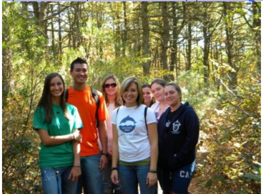
Conservation Club members hot on the trail at the Quogue Wildlife Refuge on Sunday, October 11.

http://www.danshamptons.com/content/danspapers/issue30 2009/07.html