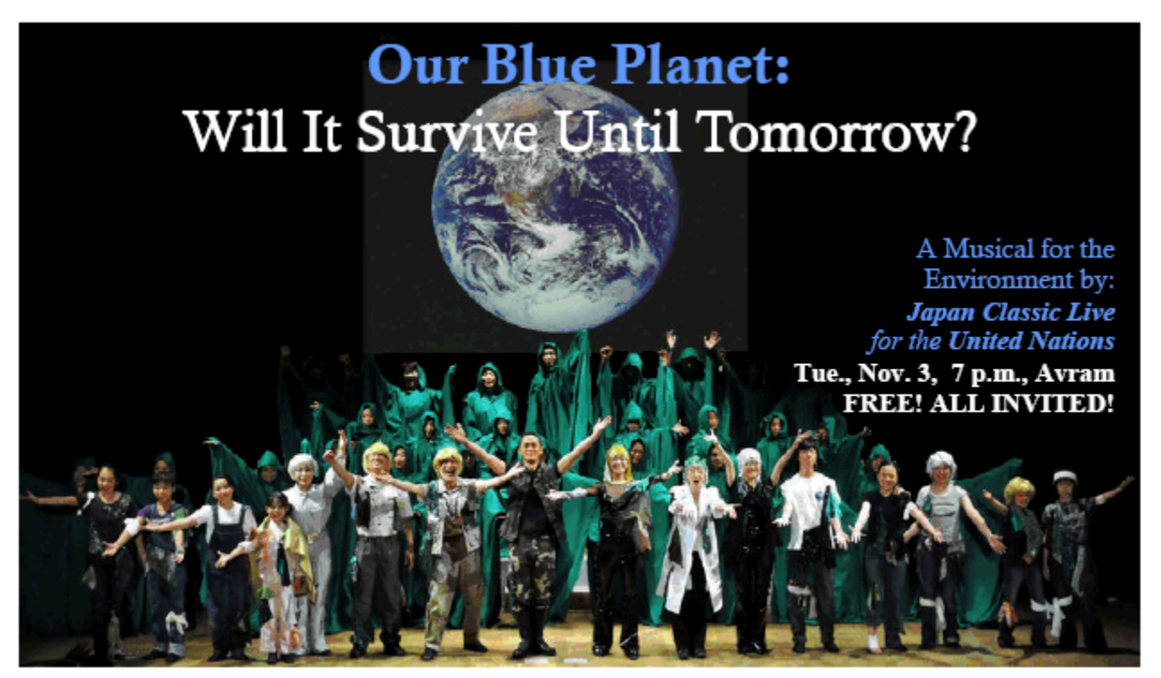
Join us for this <u>FREE</u> gala even t <u>TOMORROW NIGHT</u> -- and <u>help save Mother Earth</u> ! Declared a "Best by Southampton/East Hampton Presses. Read More: <u>http://bit.ly/4hWL4X</u> .