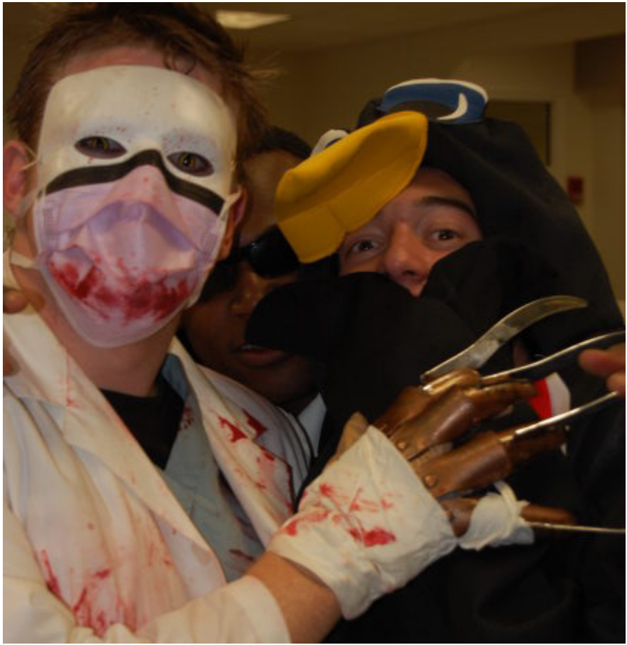
Check Out the SBS Photo Gallery -- New Halloween party pics ! http://www.stonybrook.edu/sb/southampton/photogallery.shtml .