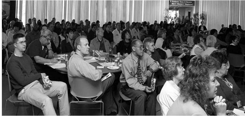
Stony Brook UUP members attend contract presentation at the Health Sciences Center.