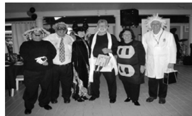
Halloween Costume Party Winners October 2009