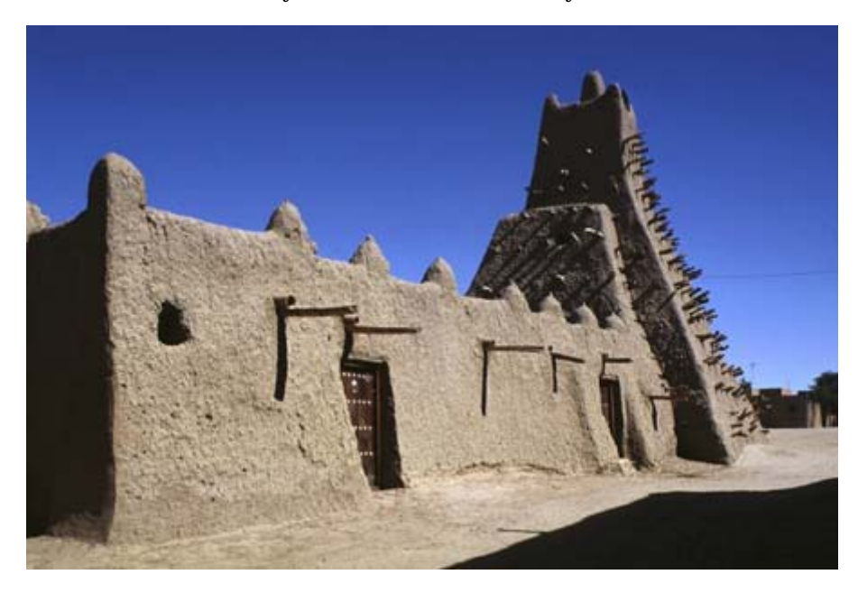
Figure 3: Timbuktu: Southern façade of the Sankore mosque, after restoration of its mud layer.

(29) Turning now to an American site, we found that over 95 percent of respondents were familiar with Mesa Verde, the impressive Anasazi