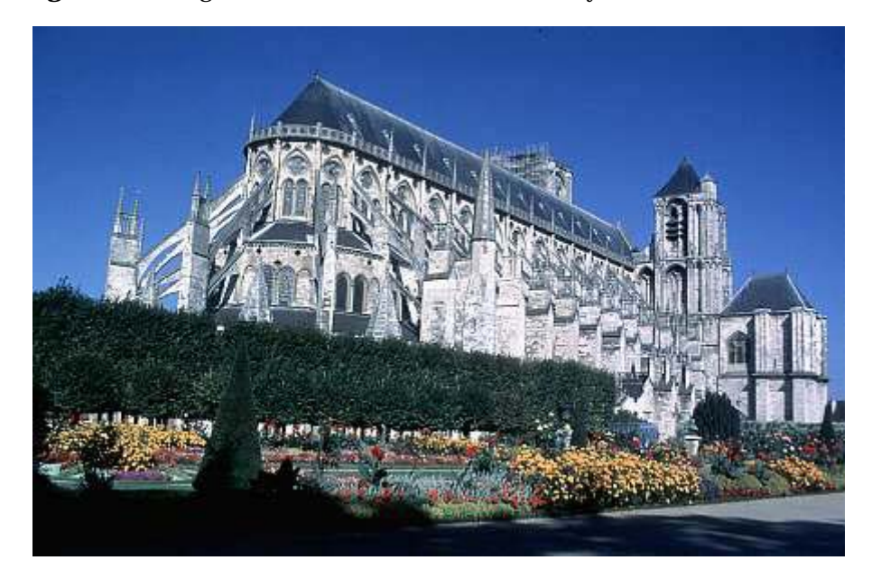
Figure 4: Bourges Cathedral

(36) In similar fashion the Wies church in Germany was also seen as typical of rococo churches, rather than as unique . Despite the fact that the World Heritage Committee has officially adopted a "global strategy" that calls for a form of sampling of "best of type" of every kind of structure and landscape, this lack of uniqueness led to respondent judgments of lower significance. A 60 year old retired attorney commented that "Since there are many rococo churches it is not quite as valuable as sites that are unusual and endangered." And a 70 year old retired publisher who had visited the Wies church wrote, "It is beautiful but not really unique or of such wide interest as other sites, e.g., St. Peter's Cathedral in Rome."