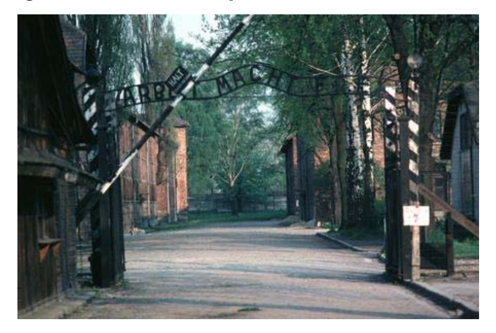
Figure 1: The Concentration Camp Auschwitz

(5) Griswold provides a model that helps us understand the variability both in national patterns of cultural reception and in the mnemonic resonance of different sites. Examining the reactions of English, West