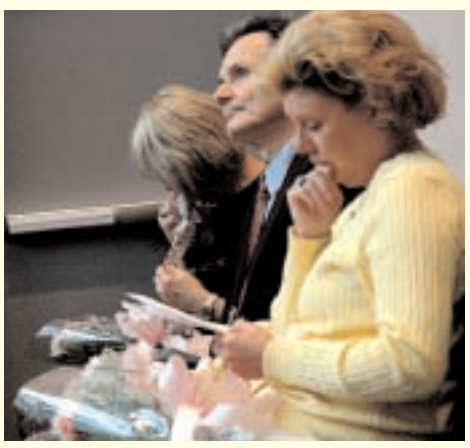
The ceremony included music and readings to honor the donors and their families.

First-year medical students held a ceremony in February for family members of those who donated their bodies for medical education.