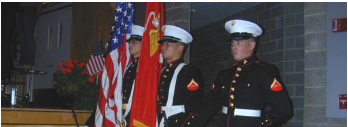
The U.S. Marine Corps 6 th Communication Battalion Service Company illustrate pride and courage during the Veterans Ceremony.