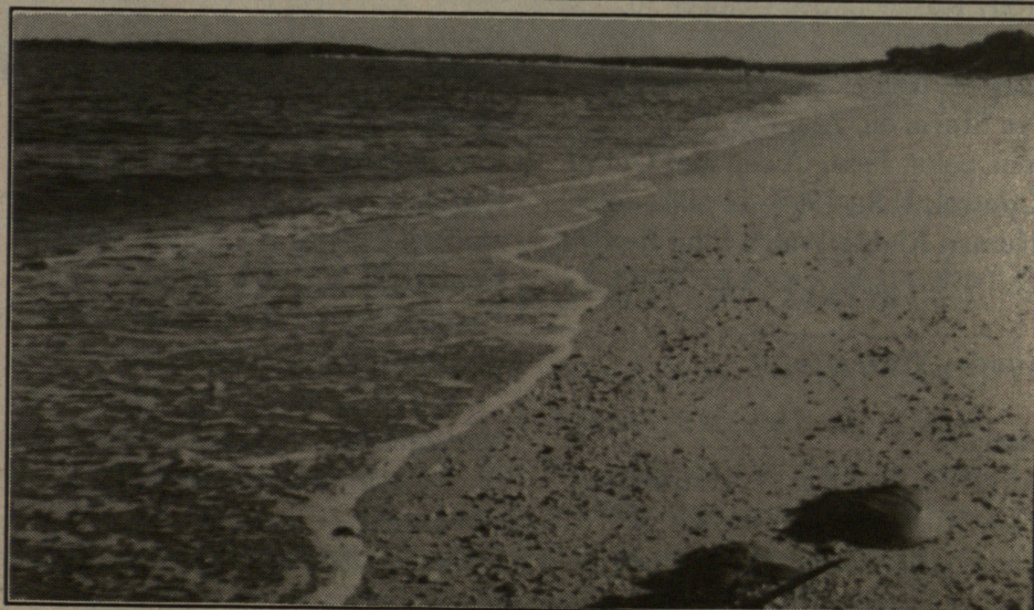
"Listen: a fourworded wavespeech: seesoo, hrss, rsseeiss, oos." - James Joyce Remnants of horseshoe crabs await the coming surf on Long Beach