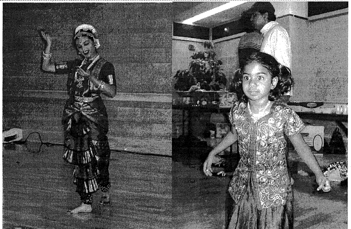
Diwali Celbration in the New SAC, a performer and a little guest.