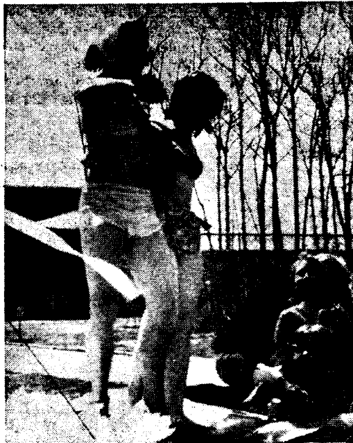
Can he or can't he?