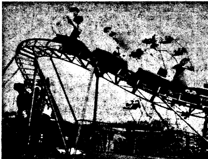
Daredevil Stony Brook students risk life and limb on death defying thrill ride of the Fair.