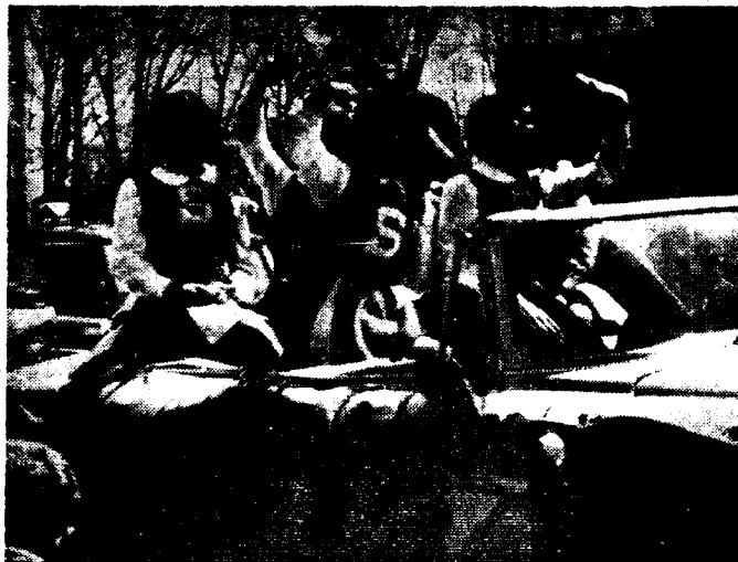
After the parade, the cars and their cheery occupants returned to campus for a day of fun and amusement.