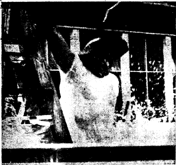
Come on in. The water is fine, and wet, and cold, miserable and . . .