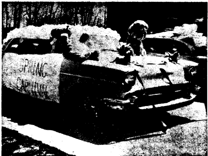
The carnival started off with a motor parade through the nearby towns. Cars were decorated and a prize was given for the best decorated car.