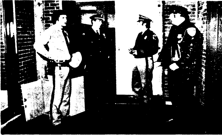
BREATHING EASIER — Campus Security detectives discuss the removal of a fire bomb from the Library carrels with Suffolk County Police.