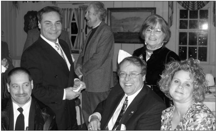
Continued on page 3