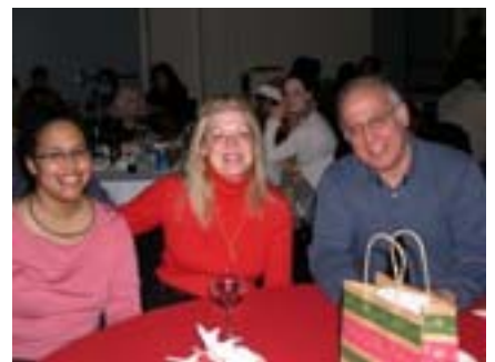
UUP ANNUAL HOLIDAY PARTY— DECEMBER 12, 2008 UNIVERSITY CAFE